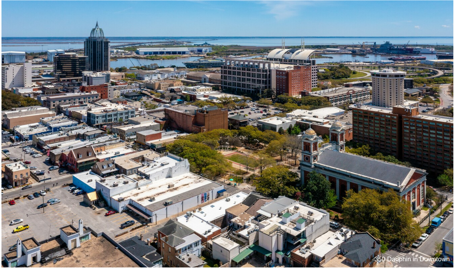
350 Dauphin in Downtown