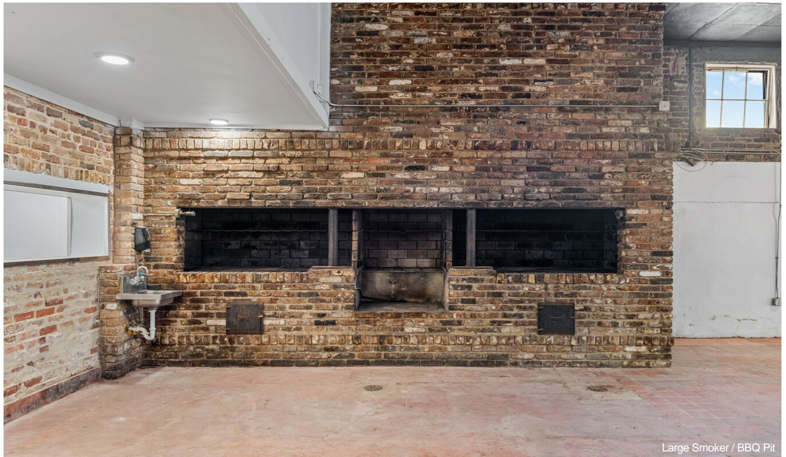
Large Smoker / BBQ Pit