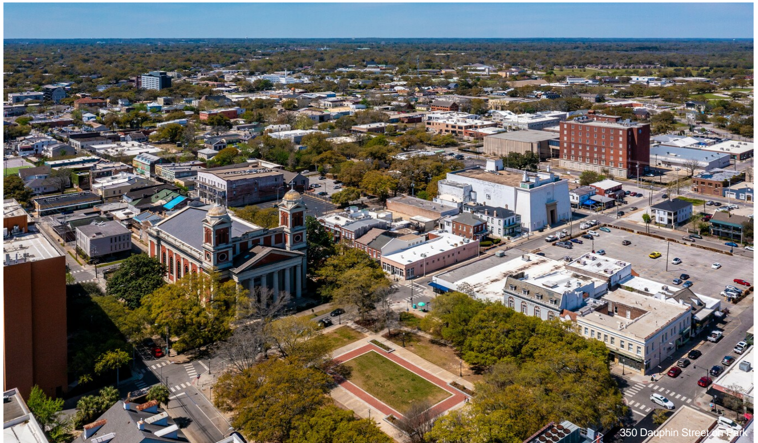
350 Dauphin Street at Day