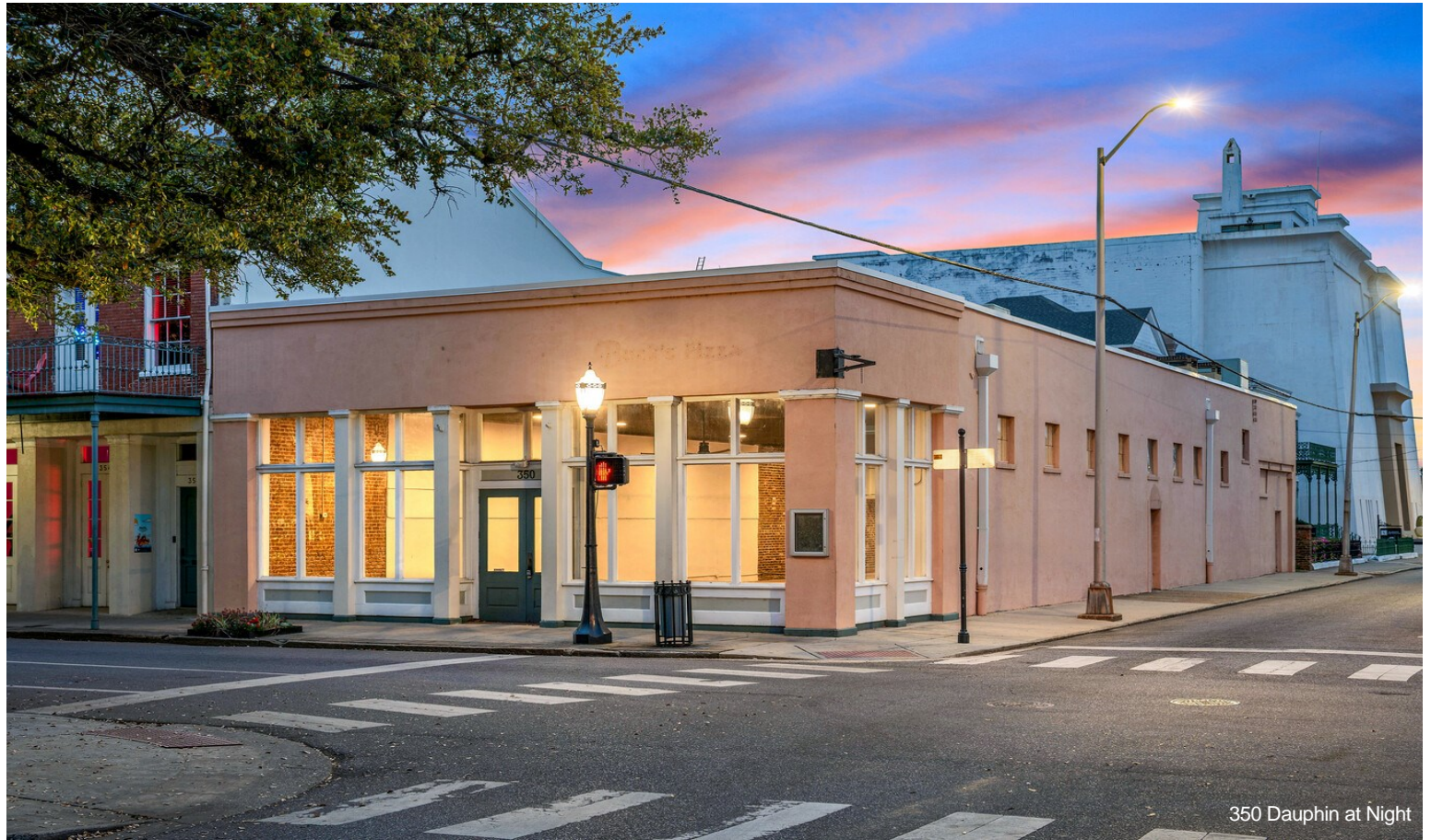
350 Dauphin at Night