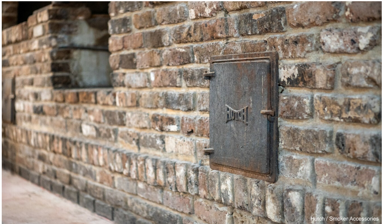
Hutch / Smoker Accessories