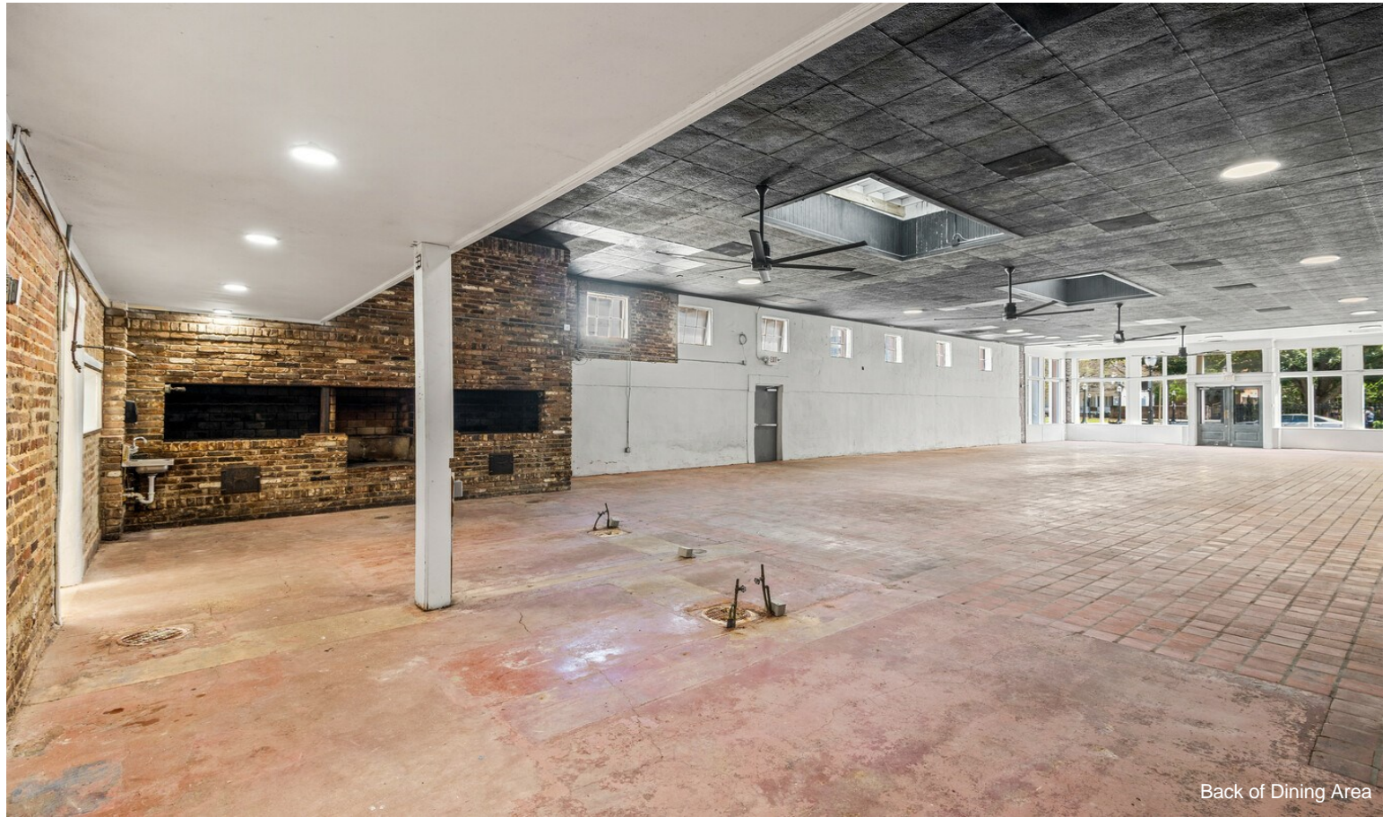
Back of Dining Area