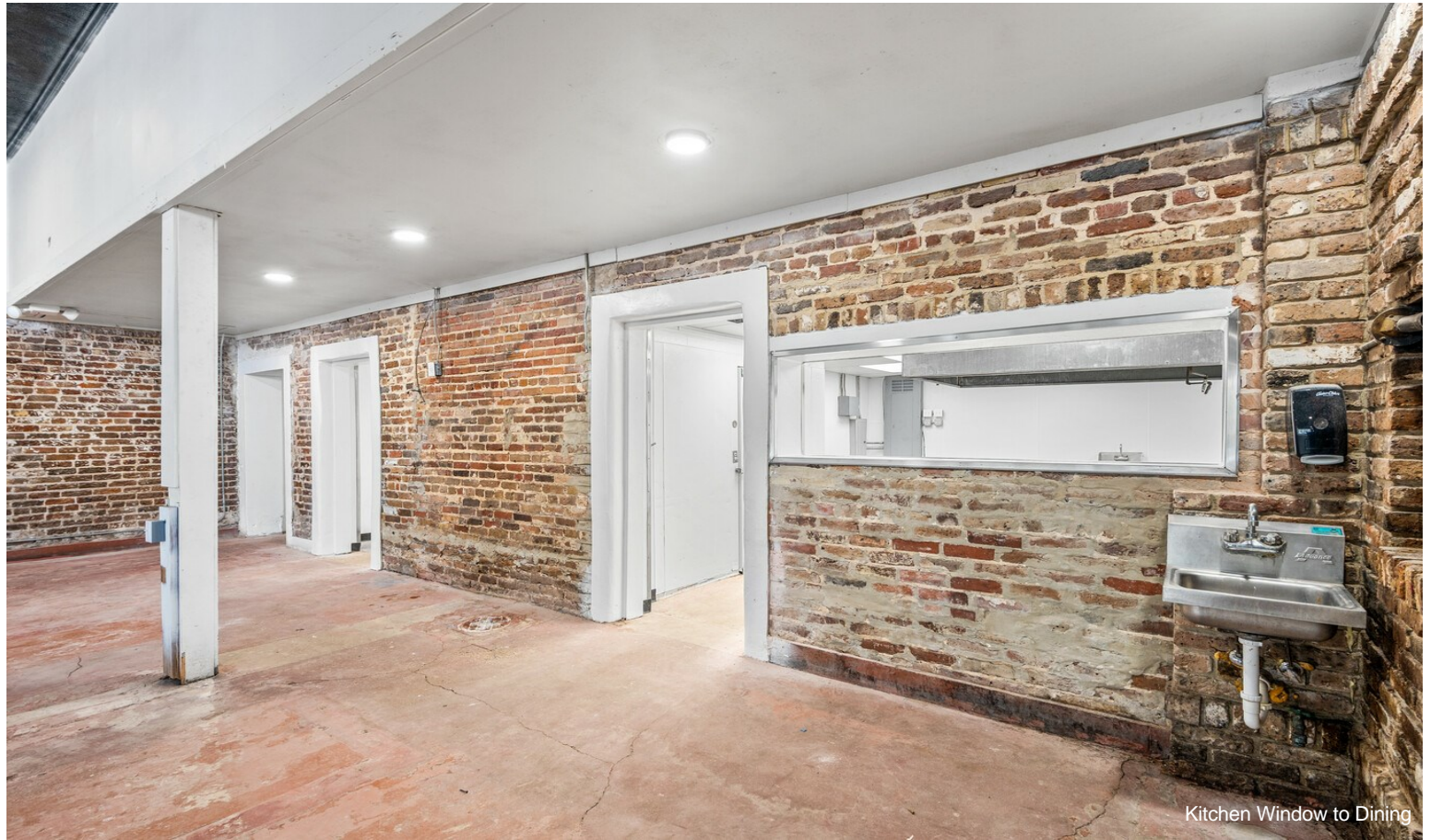
Kitchen Window to Dining