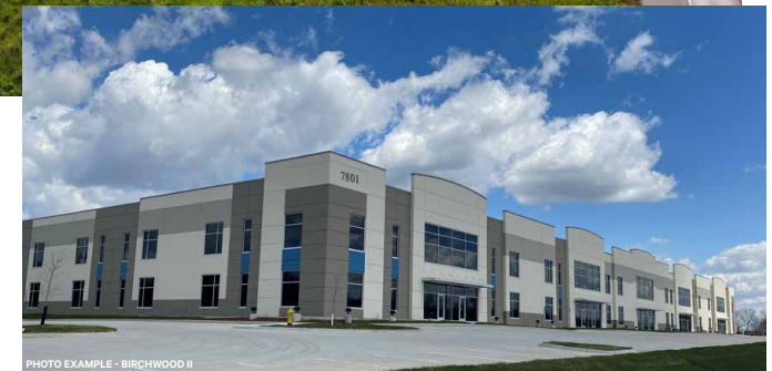
PHOTO EXAMPLE - BIRCHWOOD II