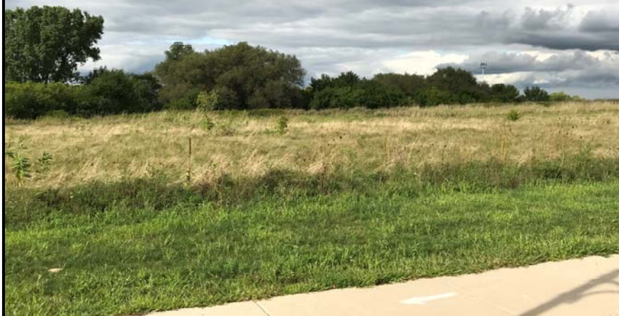
Viewing Northwest Across Parcel