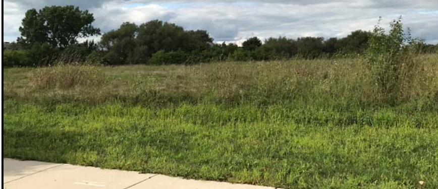
Viewing West Along Corporate Center Drive, Parcel at Right