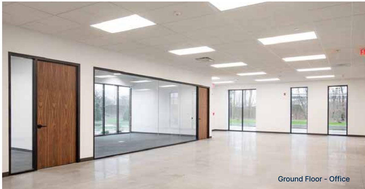
Ground Floor - Office