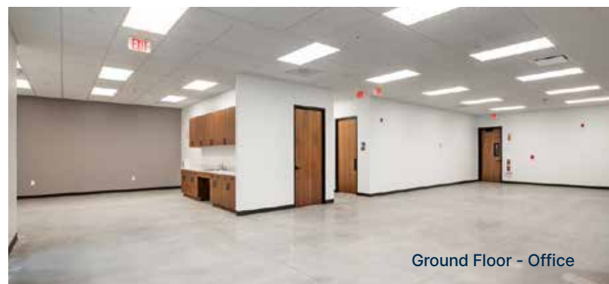
Ground Floor - Office