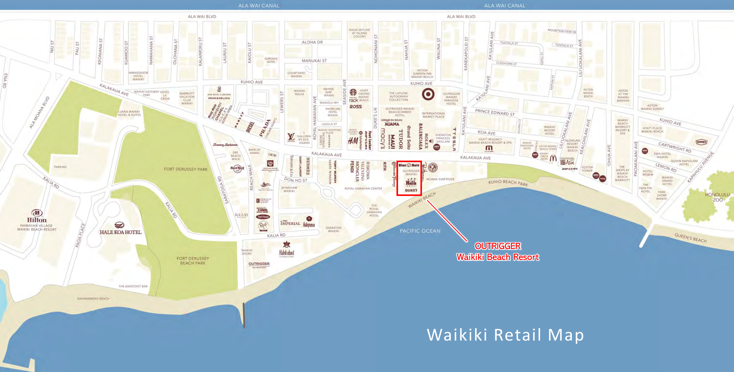
Waikiki Retail Map