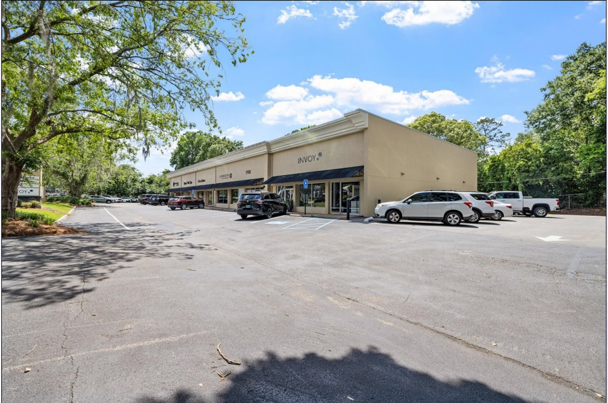
2030 Thomasville Road Exterior