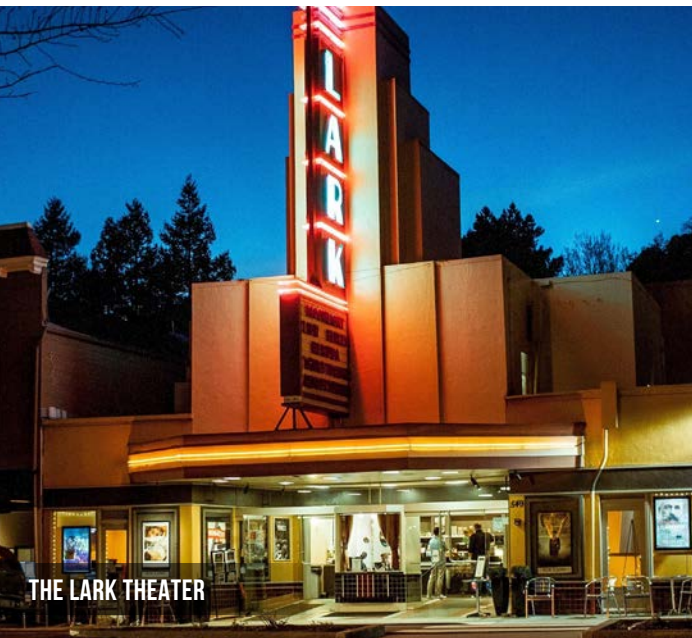
THE LARK THEATER