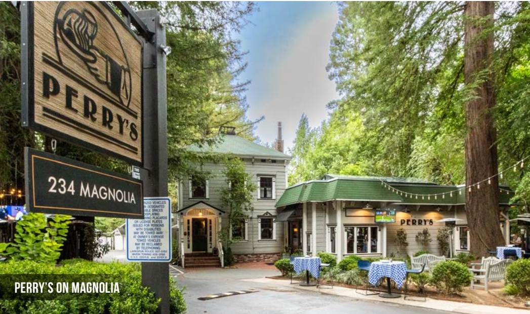
PERRY'S ON MAGNOLIA