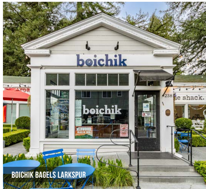
BOICHIK BAGELS LARKSPUR