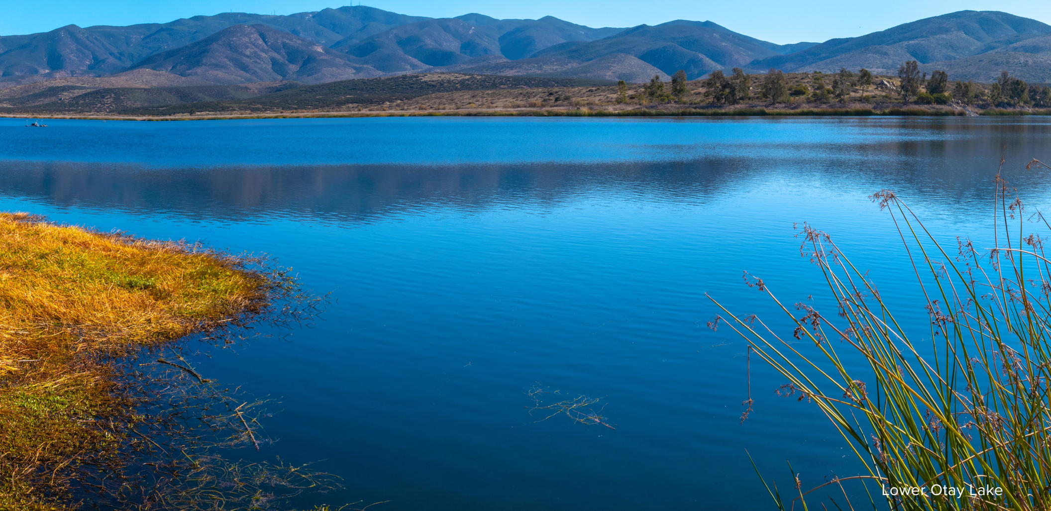
Lower Otay Lake