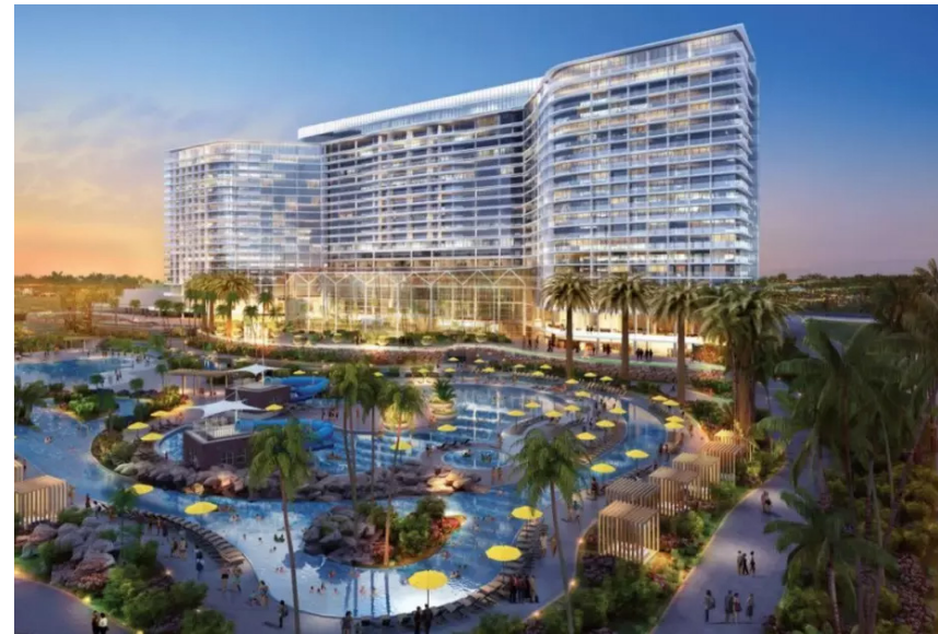
Bayfront Hotel & Convention Center