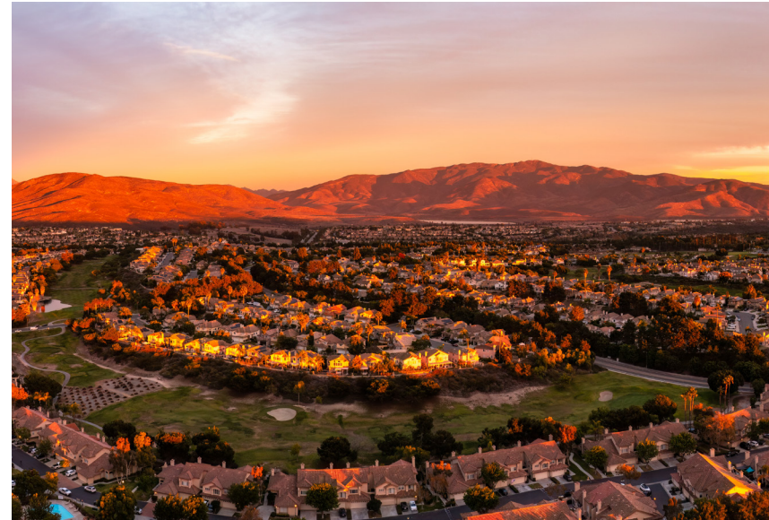
Eastlake Chula Vista

A partnership between the Port of San Diego and City of Chula Vista, the 535-acre Chula Vista Bayfront redevelopment envisions a world-class destination in the South Bay – a unique place for people to live, work and play. It is designed to create new public parks and recreational adventures, improve the natural habitat, offer new dining and shopping options, provide a world-class hotel and convention center, and more – all for residents and coastal visitors to enjoy.