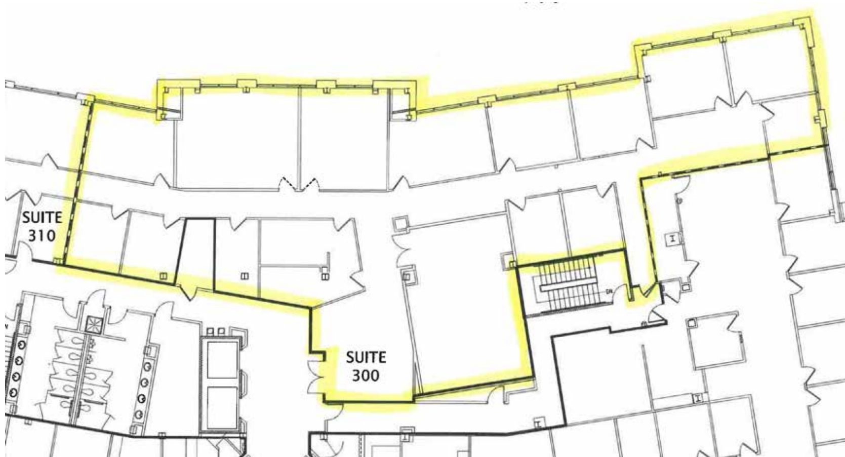
Suite 300 - 3rd Floor - 5,999± RSF