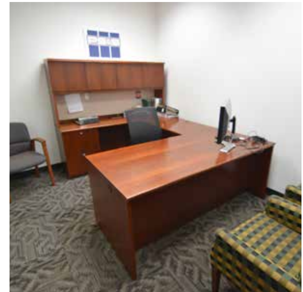
Suite 310 - 3rd Floor - 2,474± RSF