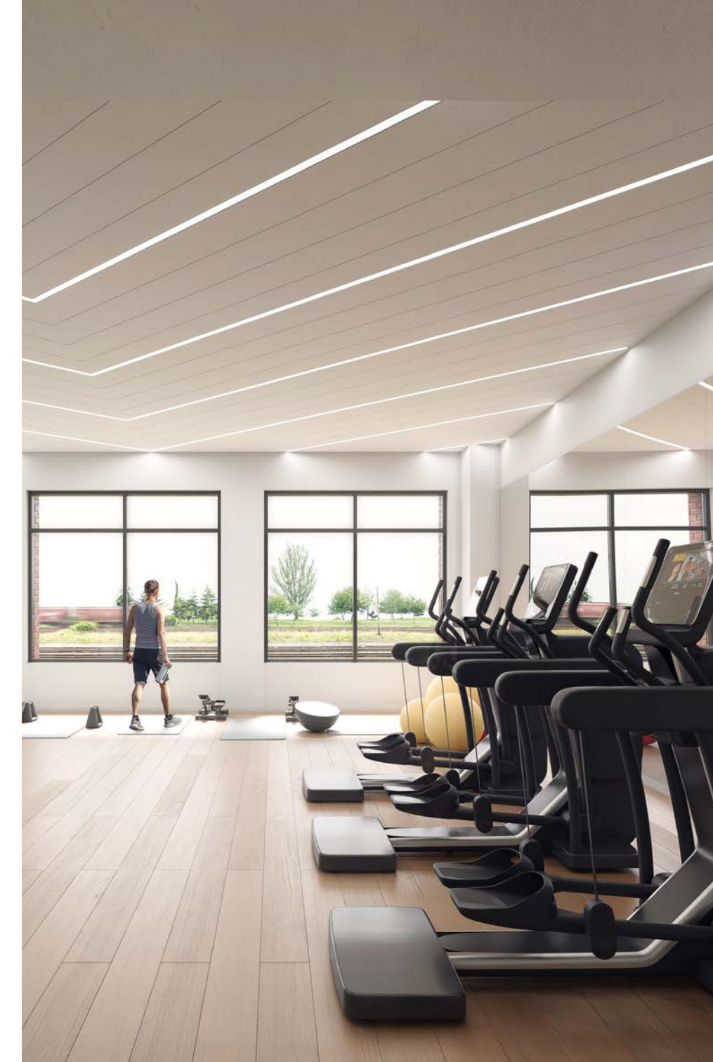
..... UPGRADED FITNESS CENTER, LOCKERS AND SHOWERS .....