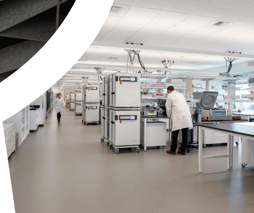
TENANT LAB AND R&D SPACE