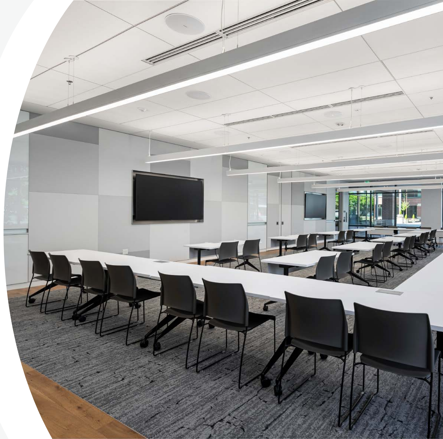
..... FULLY RENOVATED CONFERENCE FACILITY .....