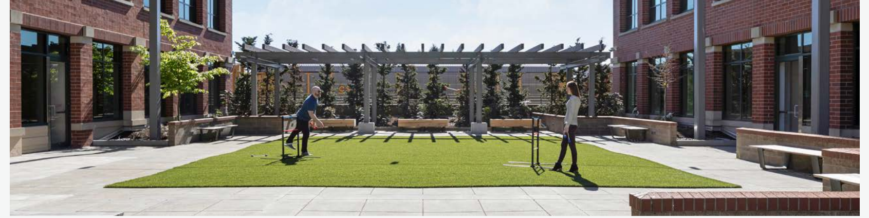
REVITALIZED COURTYARD WITH VIEWS OF ELLIOTT BAY