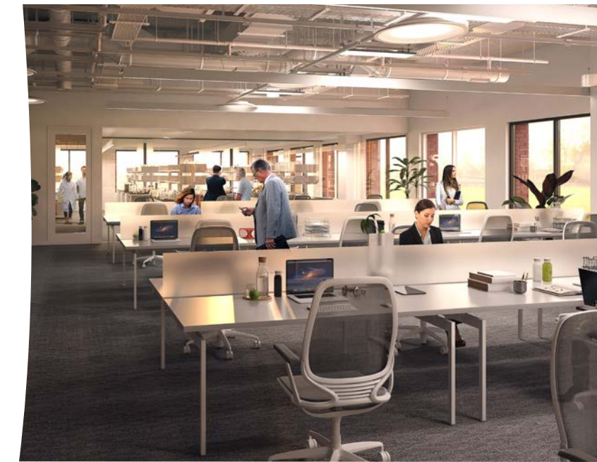
FLEXIBLE OFFICE-TO-LAB SPEC SUITE