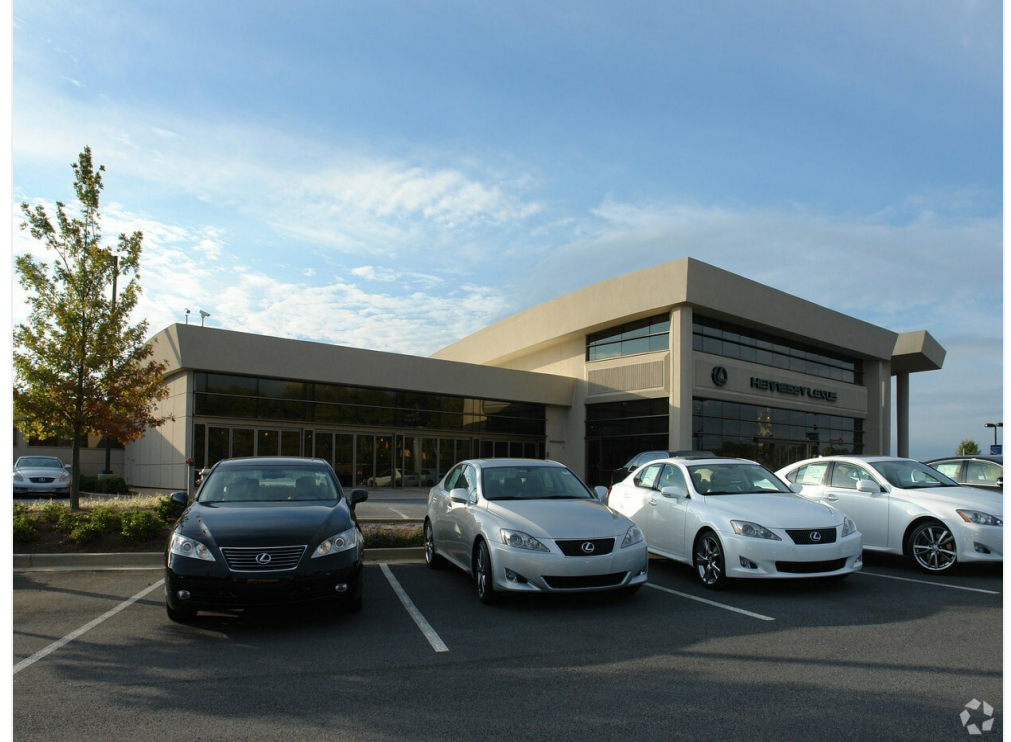
5955 Peachtree Industrial Blvd