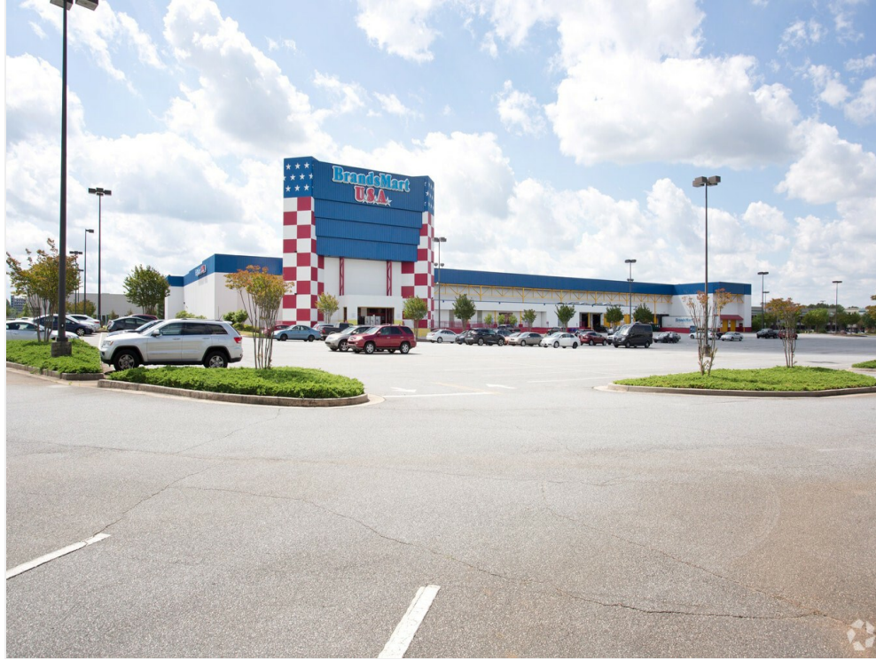
5000 Motors Industrial Way & Peachtree Industrial Blvd - BrandsMart U.S.A