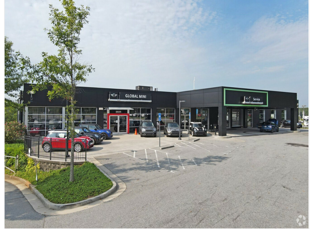
5925 Peachtree Industrial Blvd