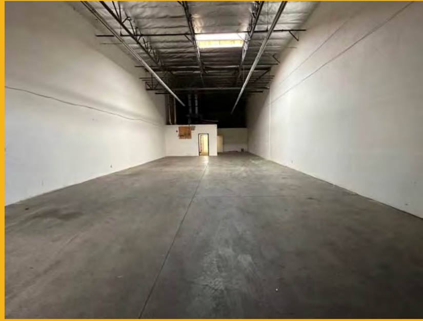
Warehouse - Facing Office