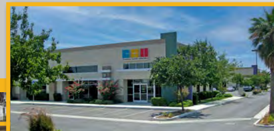
2809 Unicorn Road - Suite 107

2809 Unicorn Road - Suite 107 Bakersfield, CA