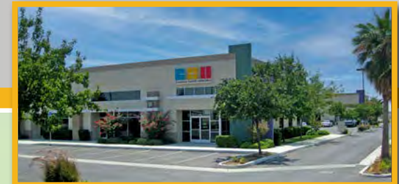
2809 Unicorn Road - Suite 107

2809 Unicorn Road - Suite 107 Bakersfield, CA