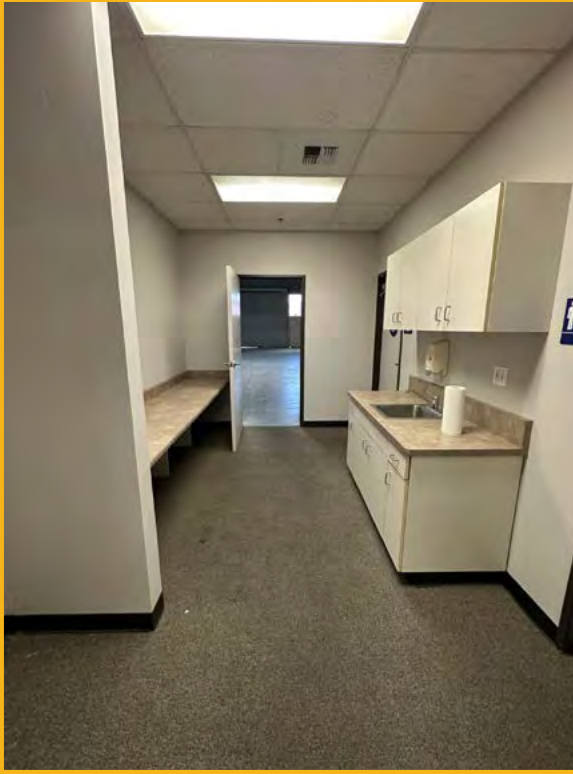
Office - Copy Room