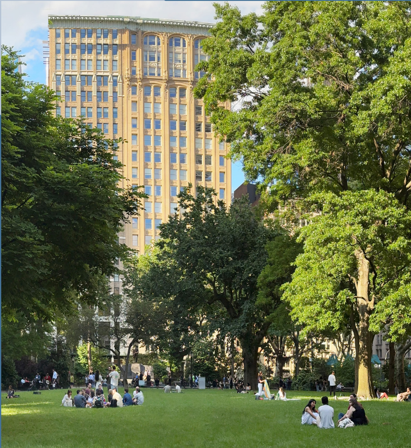
Madison Square Park

Elevate your workday with a relaxing lunch outdoors, or a breath of fresh air surrounded by lawns, fountains and trees! Enjoy a variety of evening park activities with seasonal scheduling and art displays throughout the year