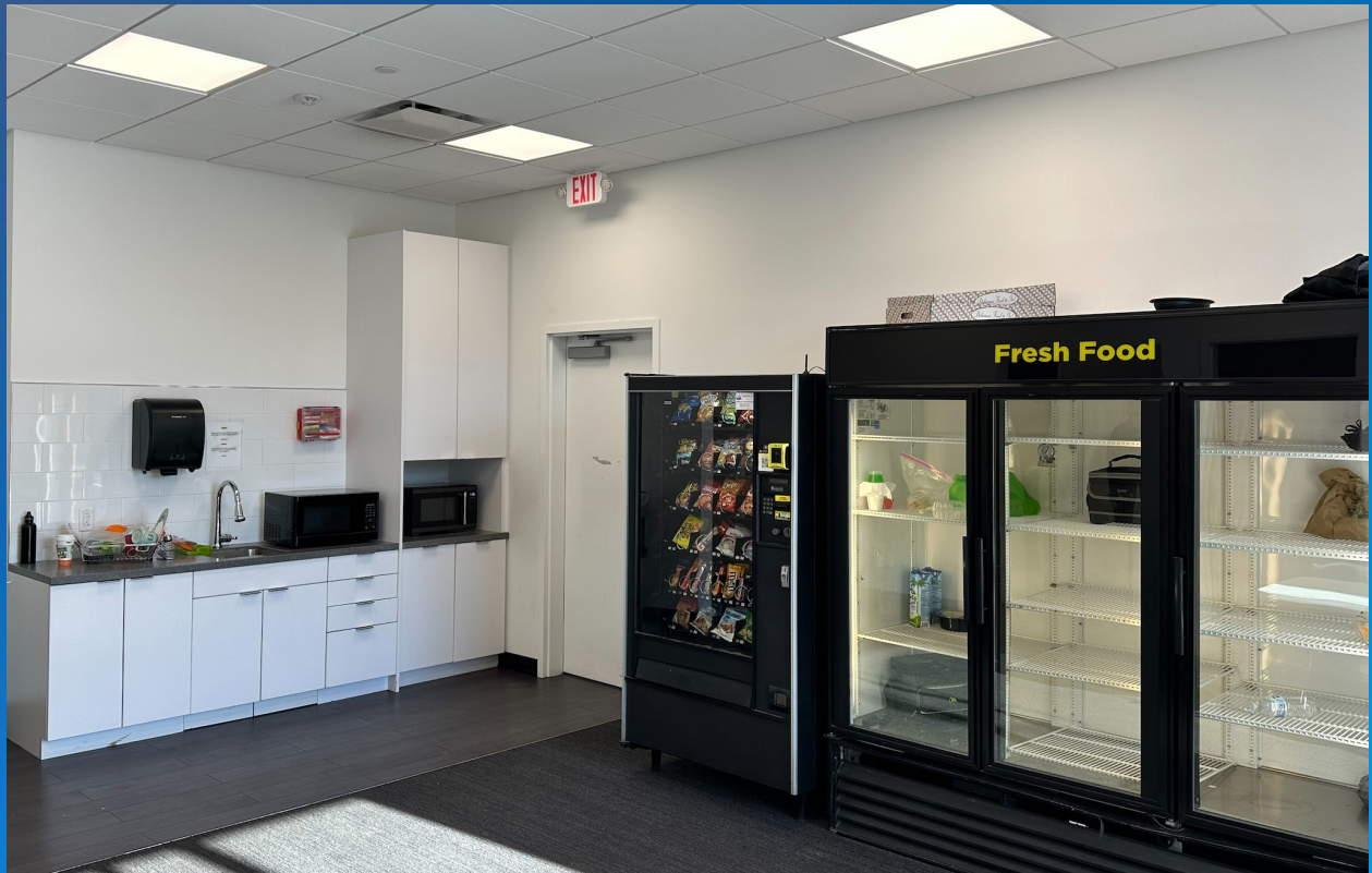
±1,700 SF office and kitchen/breakroom