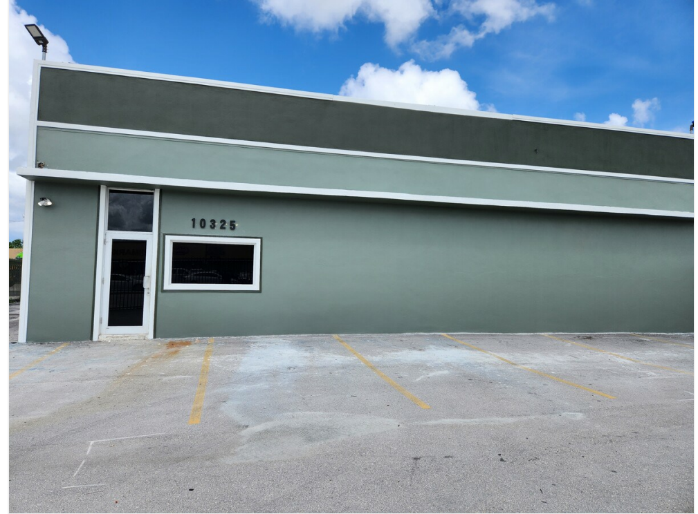
Front of the building