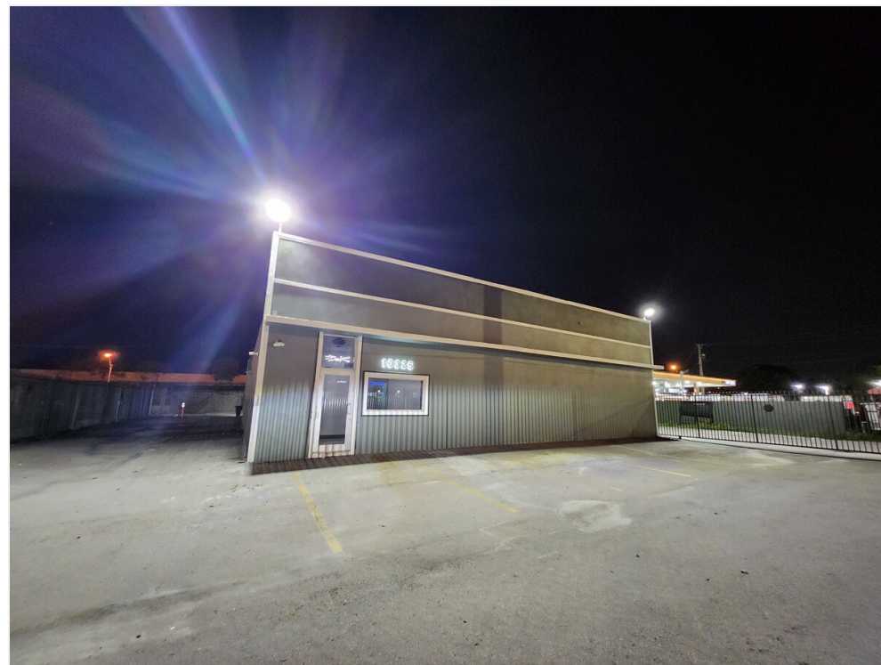
Front at night