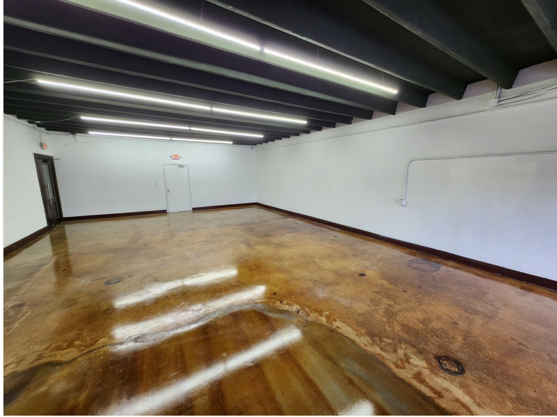
High end shop space