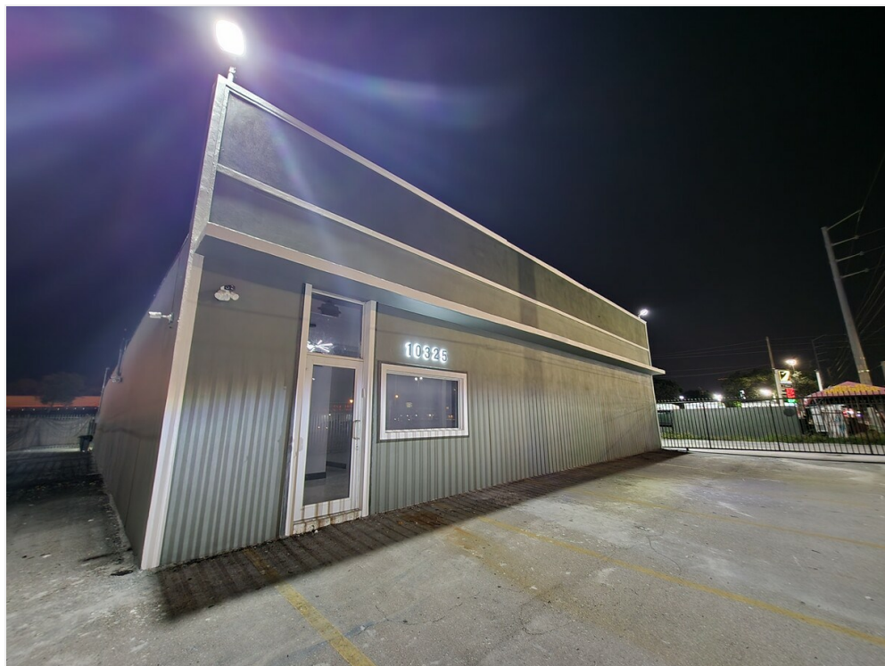
front at night