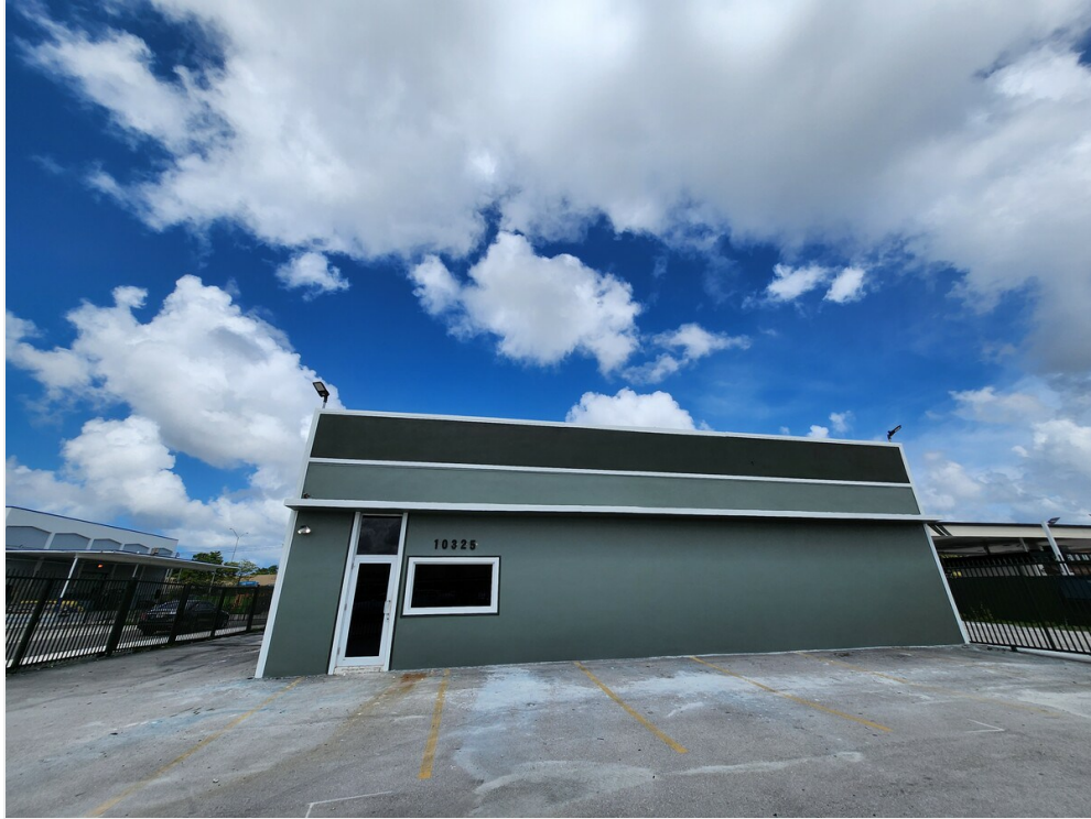
Front of the building