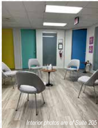
Interior photos are of Suite 205