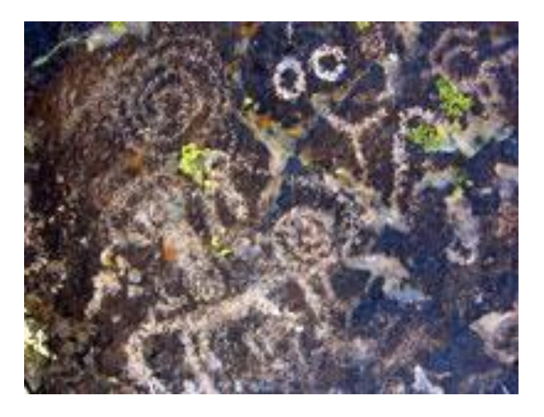
Stop 5: End of the Pavement at the apple orchards at Elgin and Elgin School State Park. (1.9 miles south of Stop 4).