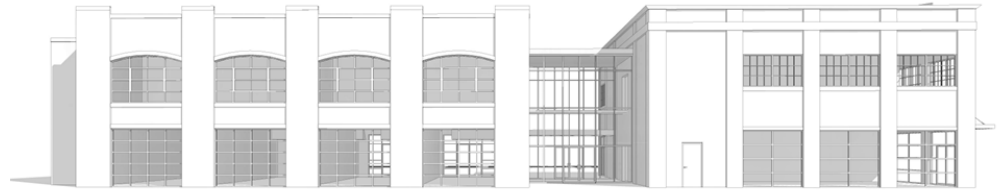
NORTH ELEVATION | 2