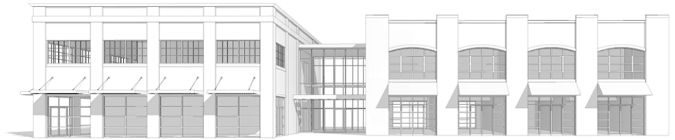
SOUTH ELEVATION | 1