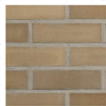
Brick Veneer Color B