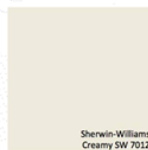
Stucco Accents Sherwin-Williams Paint Color: Creamy 7012