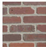
Brick Veneer Color A