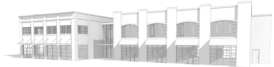
SOUTHEAST VIEW | 4