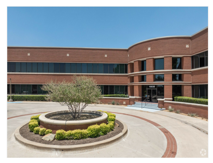
10030 N MacArthur Boulevard