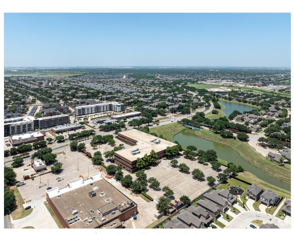
Surrounded by Affluent Neighborhoods