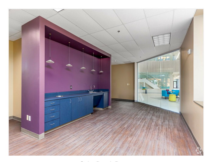
Suite Break Room