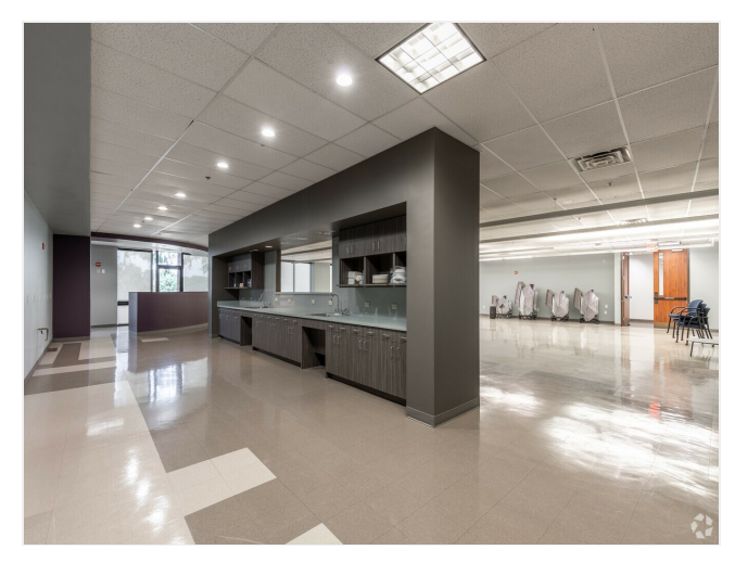
Suite Meeting Room