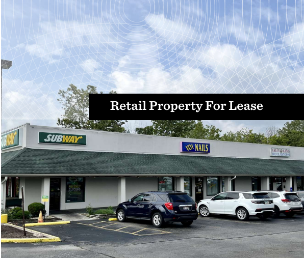
Retail Property For Lease