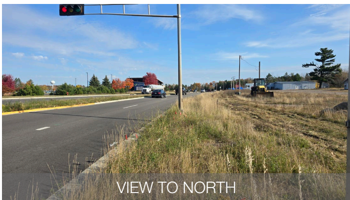
VIEW TO NORTH