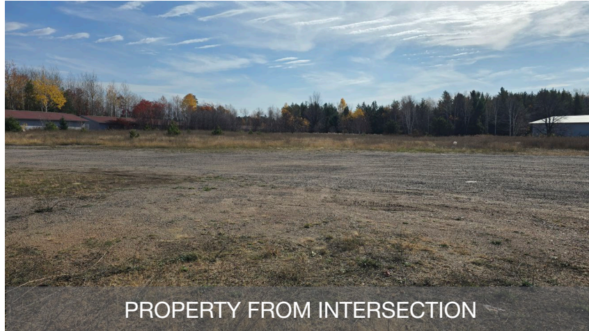
PROPERTY FROM INTERSECTION