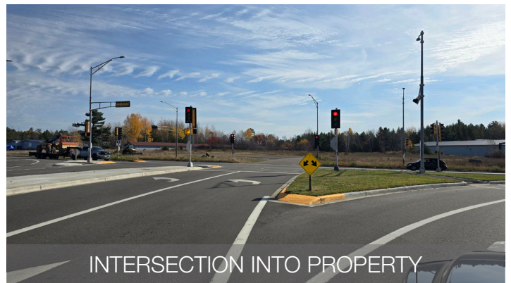
INTERSECTION INTO PROPERTY