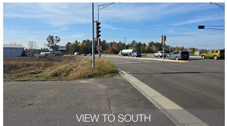
VIEW TO SOUTH