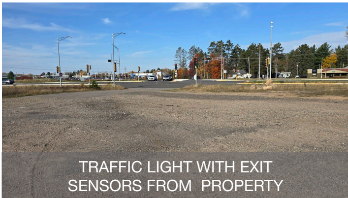
TRAFFIC LIGHT WITH EXIT SENSORS FROM PROPERTY