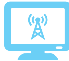
COMMUNICATION & TECHNOLOGY