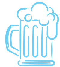
MICRO BREWERIES & SPECIALTY FOOD