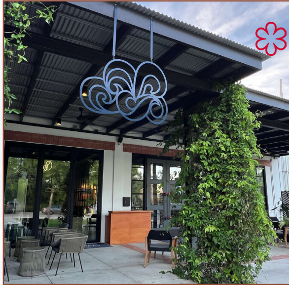
James Beard Nominees | Michelin Guide Restaurants