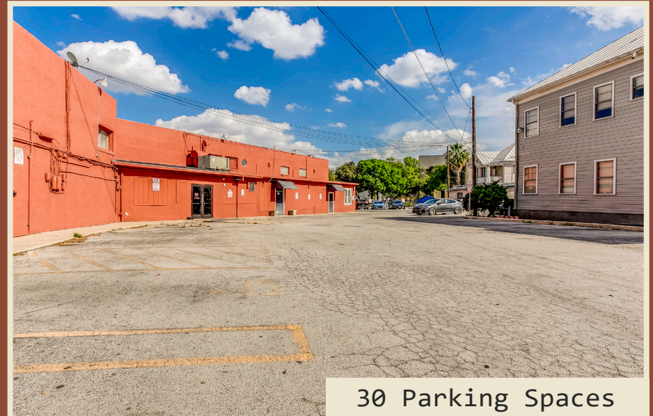
30 Parking Spaces