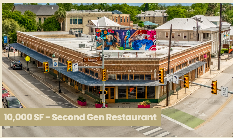
10,000 SF - Second Gen Restaurant

Iconic Southtown restaurant, positioned in one of San Antonio's most walkable and dynamic urban districts. Surrounded by top-tier dining, nightlife, and cultural attractions, this is a rare opportunity to establish a flagship presence in a proven, and high traffic location.