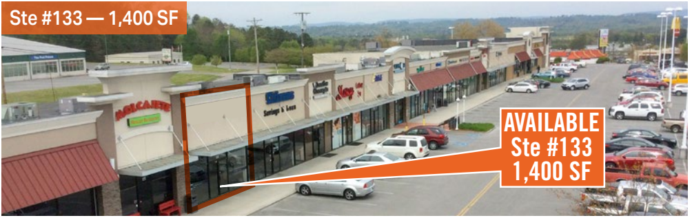
Ste #133 — 1,400 SF