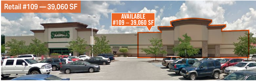
Retail #109 — 39,060 SF