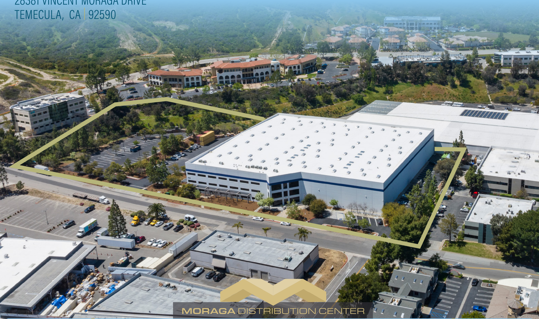
MORAGA DISTRIBUTION CENTER

109,741 SF / SINGLE-TENANT INDUSTRIAL DISTRIBUTION BUILDING