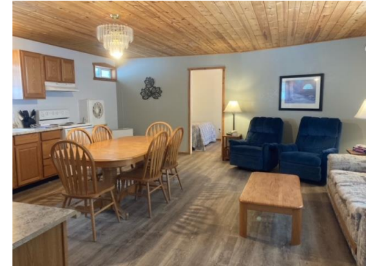
[Two Bedroom Suite in the Motel]

Come experience our mountain resort, a place like no other. Check out our Facebook Page.