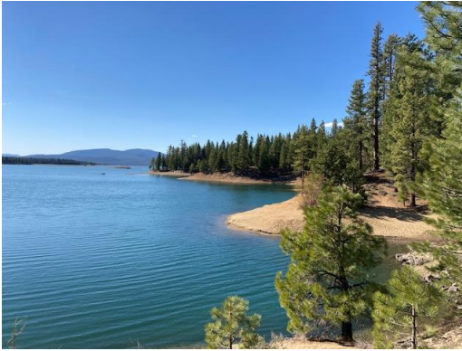
Summer, East Shore Lake Davis, California