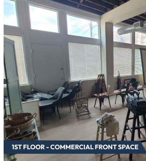
1ST FLOOR - COMMERCIAL FRONT SPACE