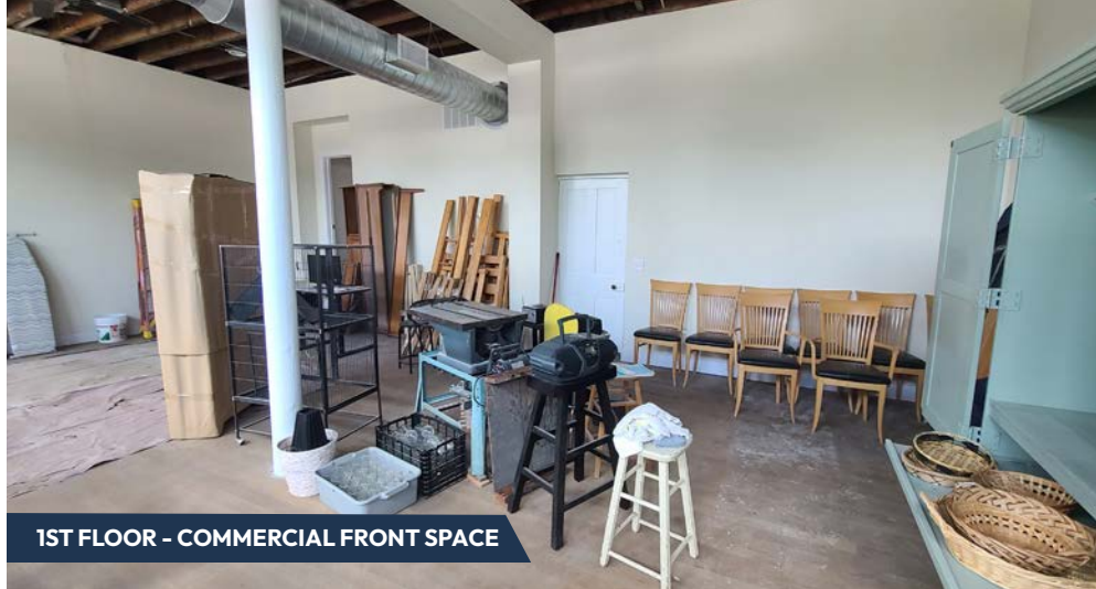
1ST FLOOR - COMMERCIAL FRONT SPACE