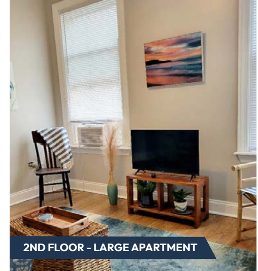
2ND FLOOR - LARGE APARTMENT