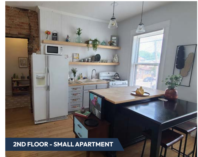
2ND FLOOR - SMALL APARTMENT