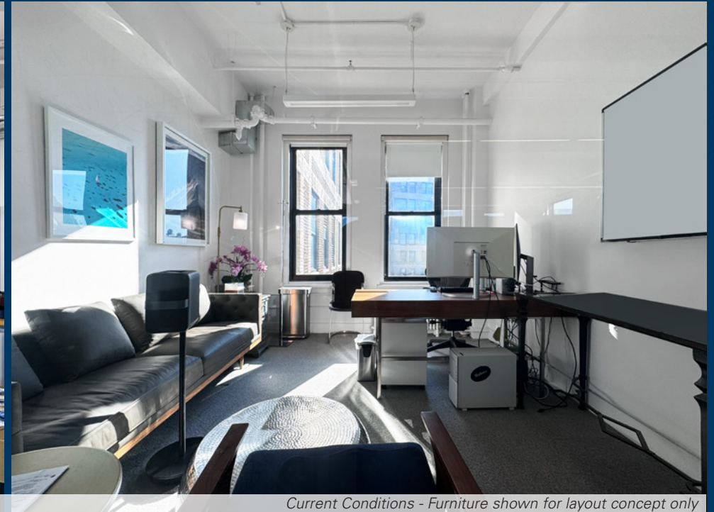
Current Conditions - Furniture shown for layout concept only

ABS Partners Real Estate, as the exclusive agent is pleased to offer the following opportunity for lease: