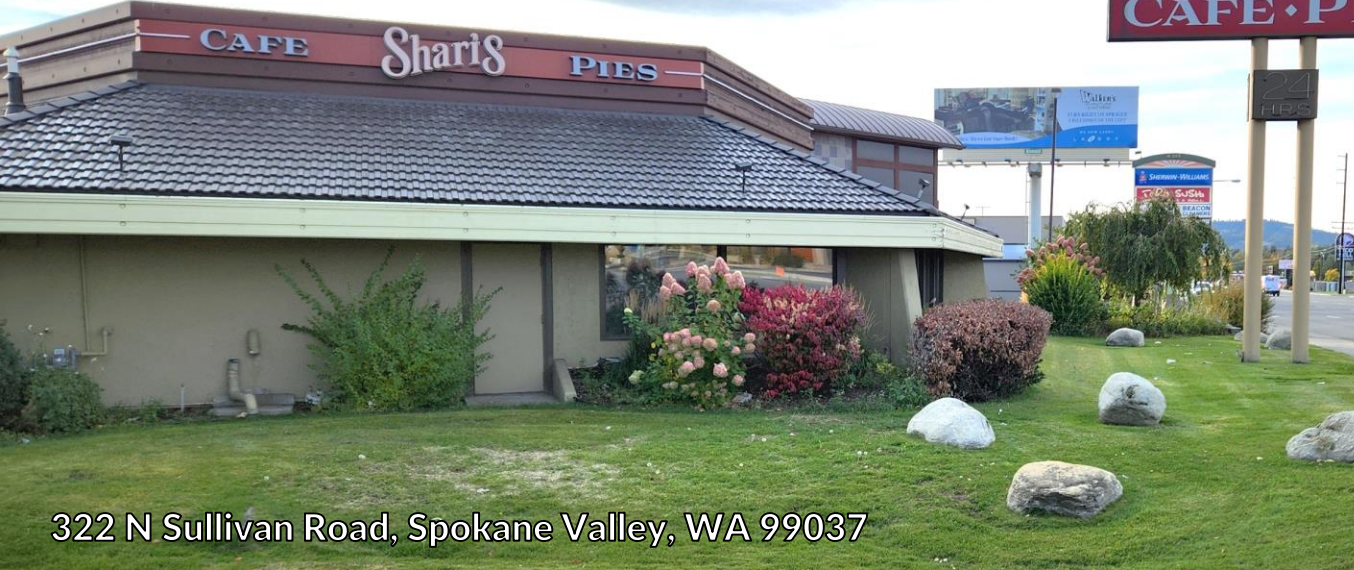
322 N Sullivan Road, Spokane Valley, WA 99037