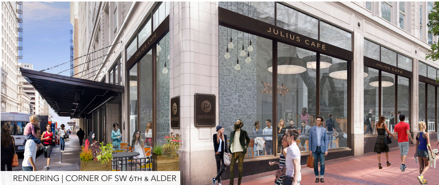
RENDERING | CORNER OF SW 6TH & ALDER