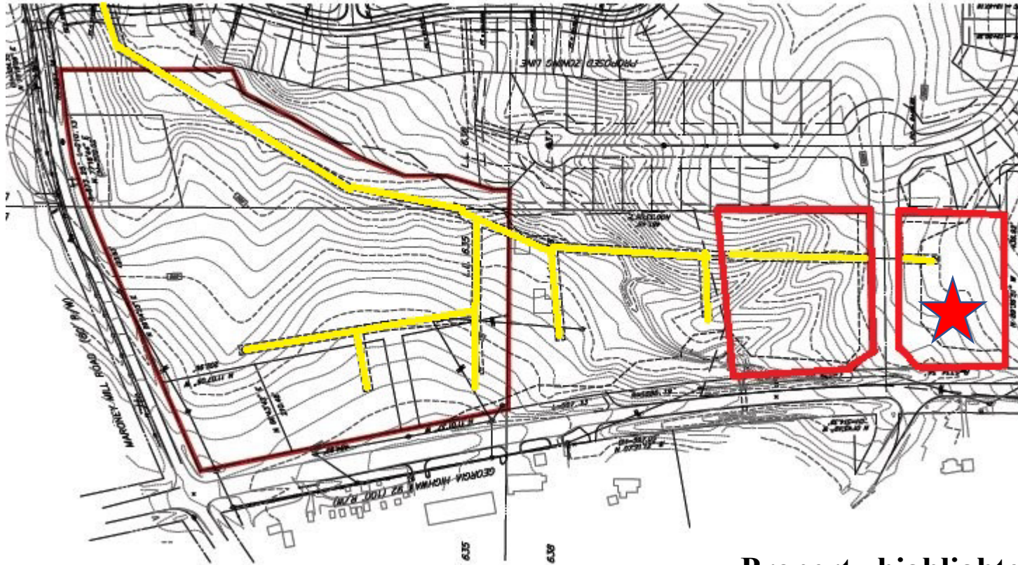
Property highlighted in Red Proposed sewer lines in Yellow

EXCLUSIVELY OFFERED BY WILSON HUTCHISON REALTY, LLC