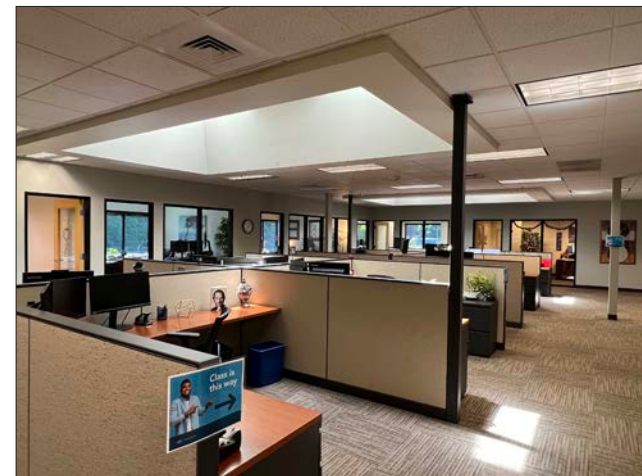
Open Work Area