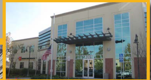
9201 Camino Media