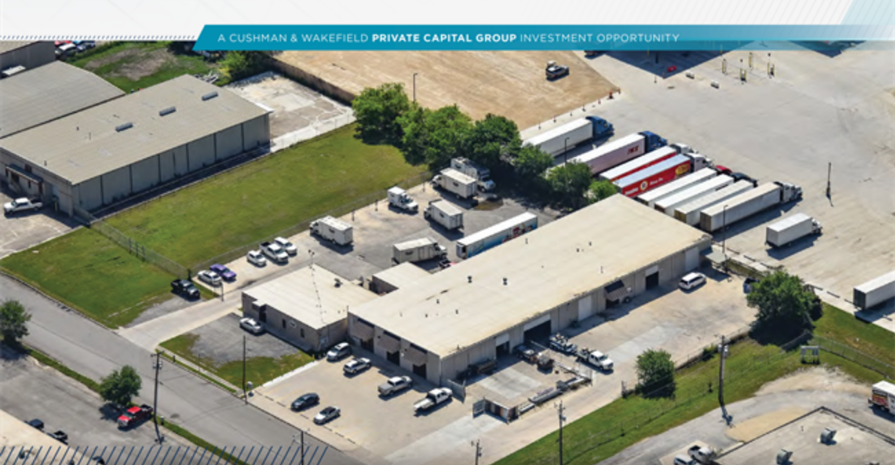
RARE INDUSTRIAL OWNER/USER OPPORTUNITY

4896-4900 CENTER PARK BLVD. | SAN ANTONIO, TX 78218