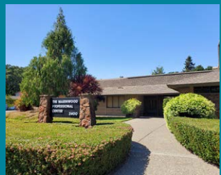
The Marinwood Professional Center