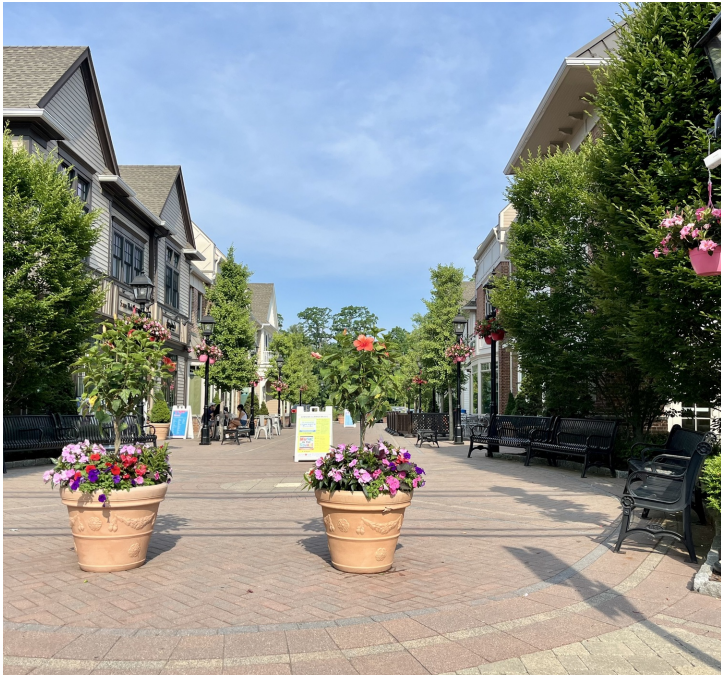
Armonk Town Square