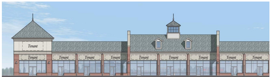
PARTIAL NORTH ELEVATION