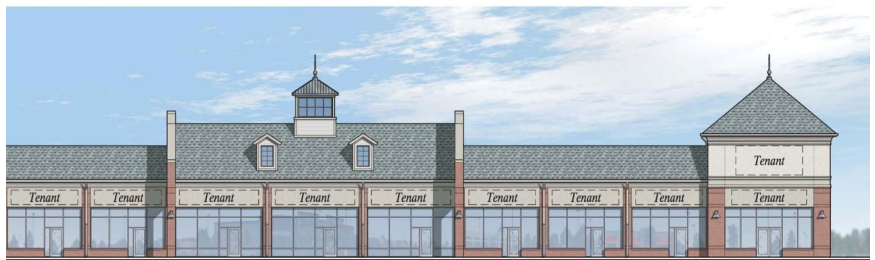
PARTIAL NORTH ELEVATION