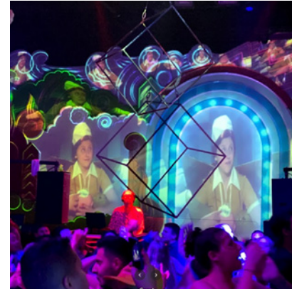
THE GREAT NORTHERN