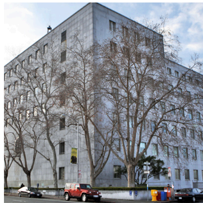
HALL OF JUSTICE