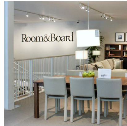
ROOM & BOARD