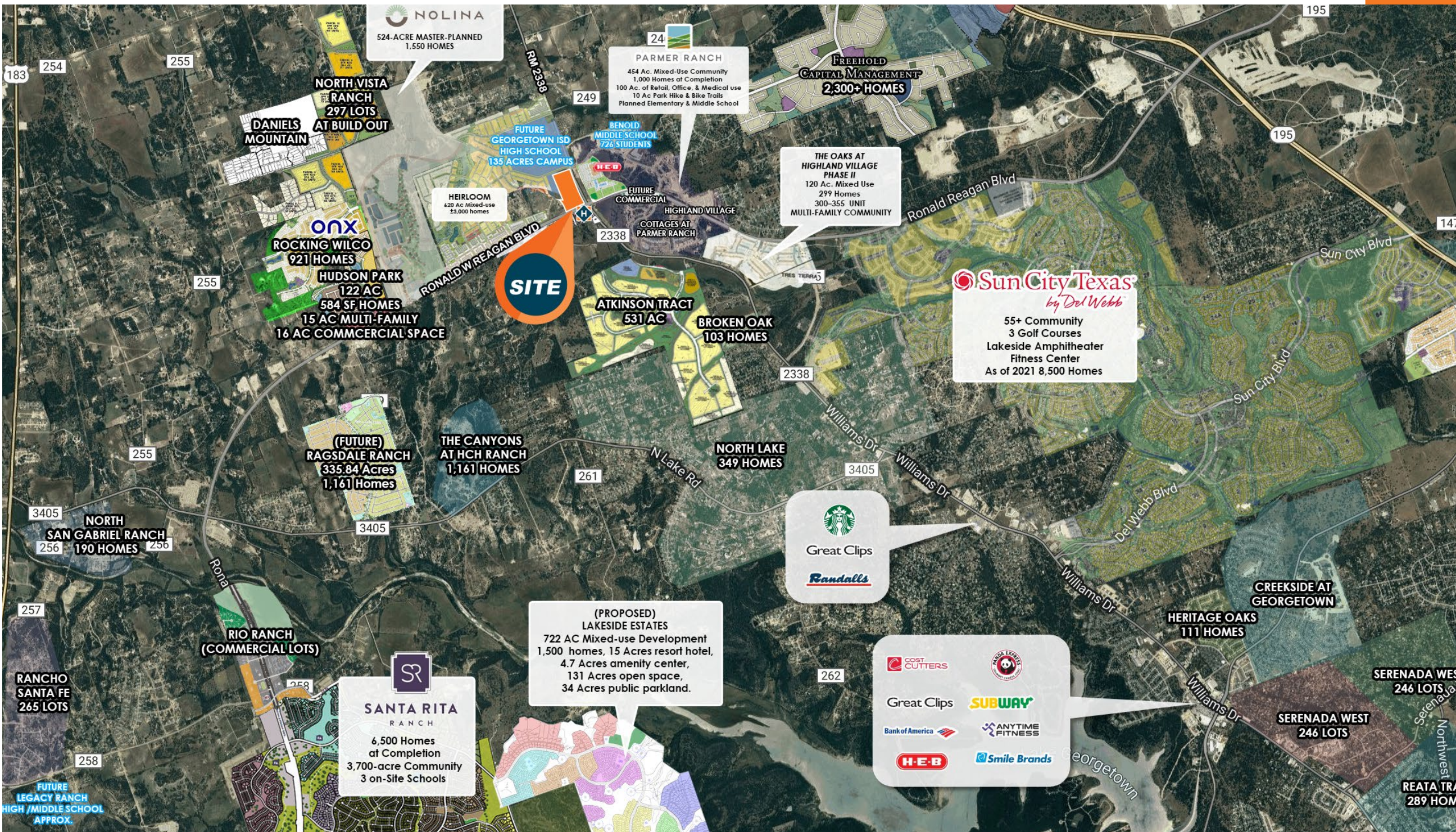
Shops at Williams Ranch Pad Sites | NWC of Ronald Reagan Blvd. & Williams Dr Georgetown, Texas 78633