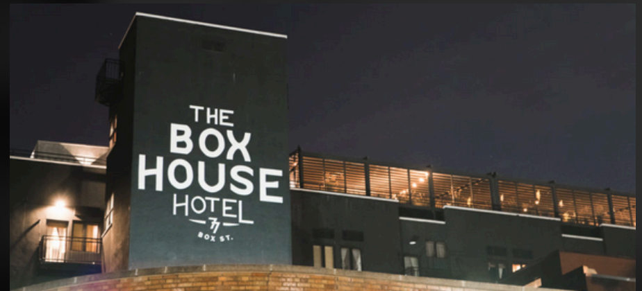
THE BOX HOUSE HOTEL - 7 - BOX ST.