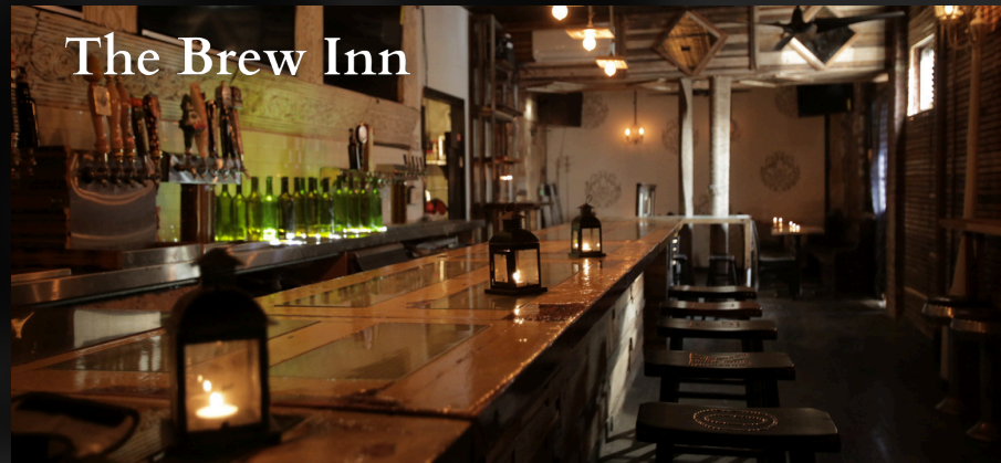
The Brew Inn