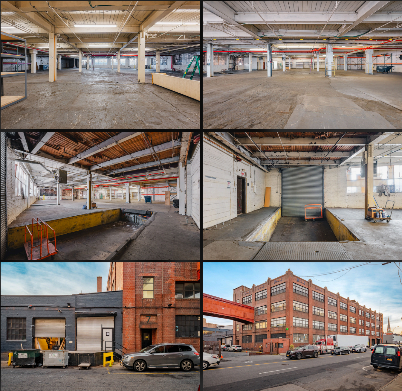
GROUND FLOOR (246 GREENPOINT AVE)