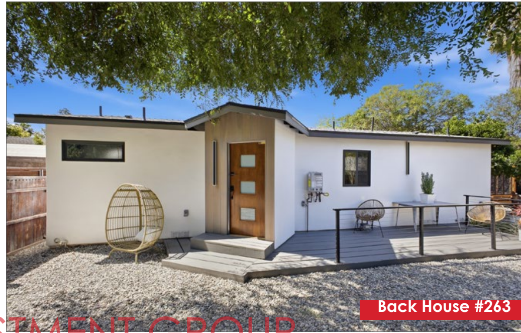
Back House #263