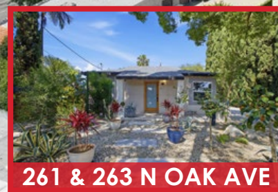
261 & 263 N OAK AVE