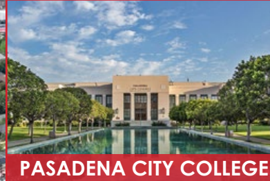
PASADENA CITY COLLEGE