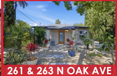
261 & 263 N OAK AVE