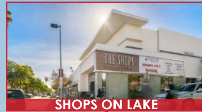
SHOPS ON LAKE