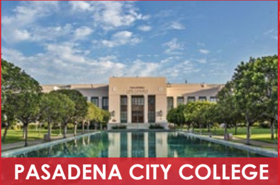
PASADENA CITY COLLEGE