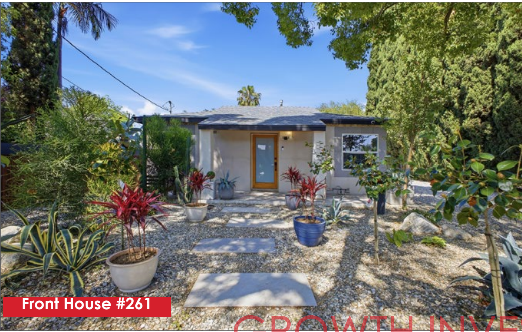
Front House #261