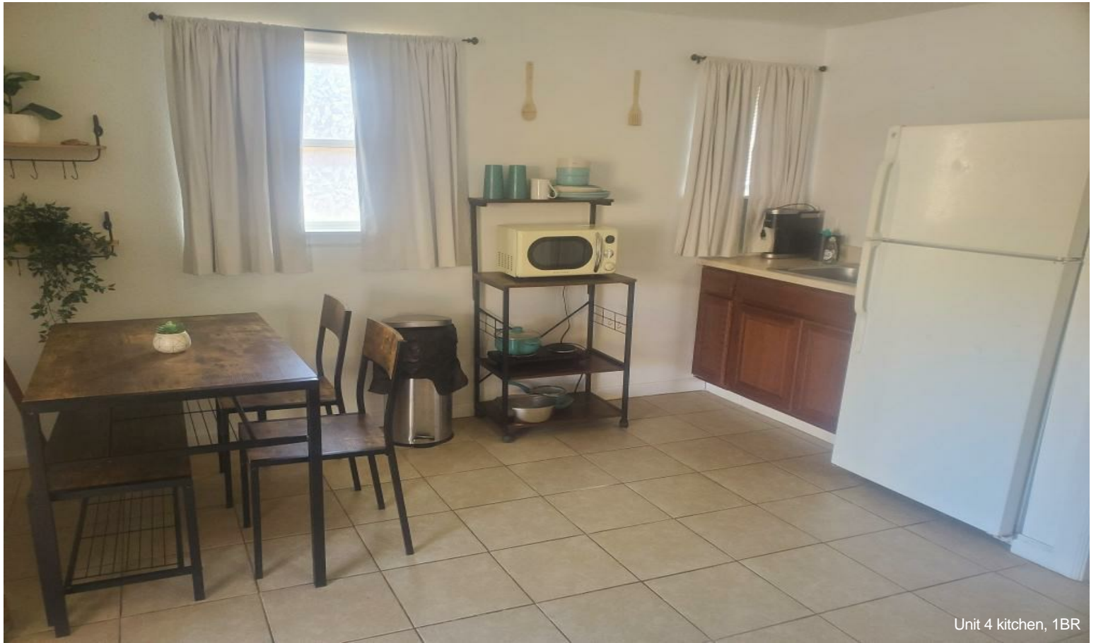
Unit 4 kitchen, 1BR