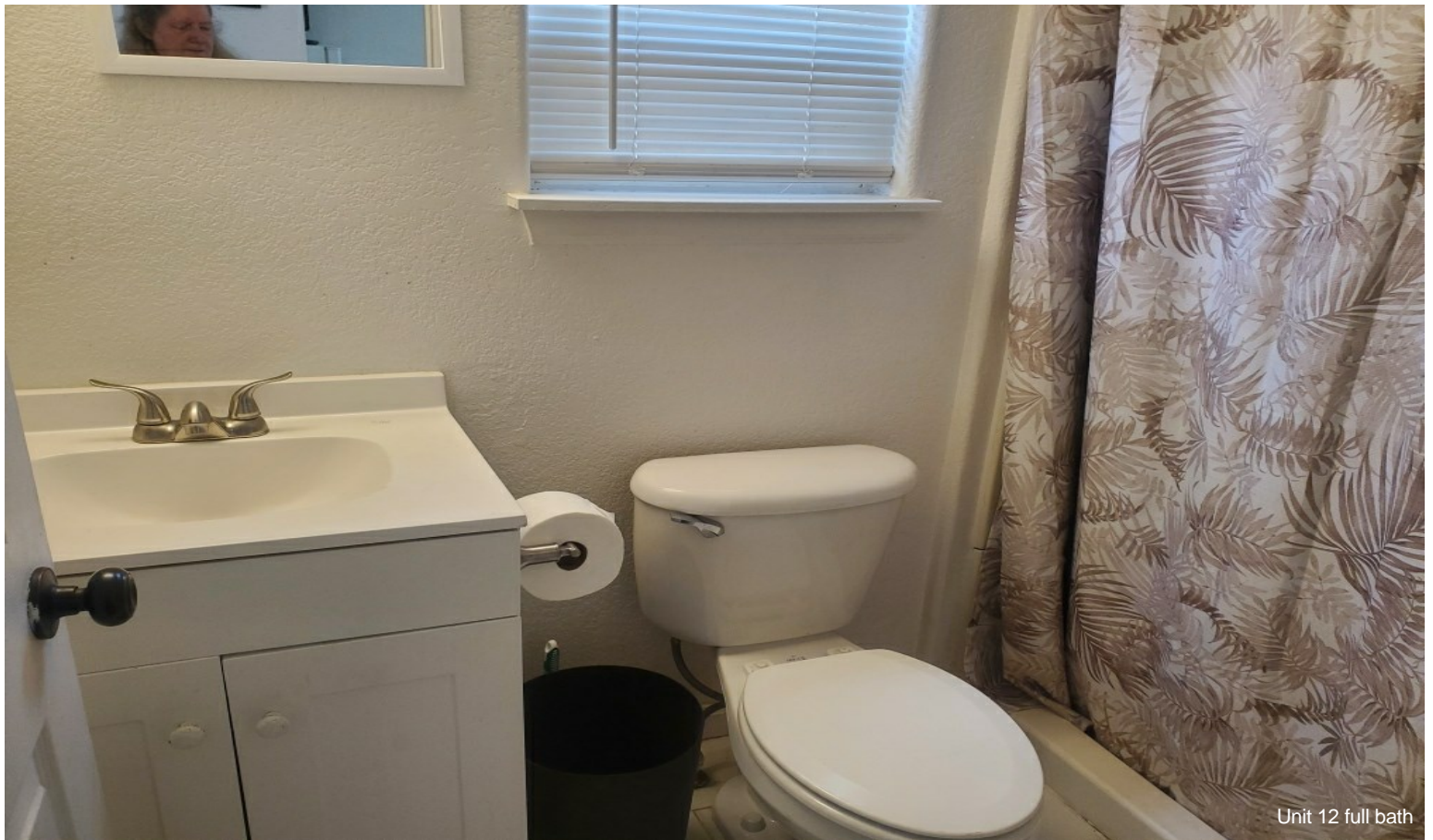
Unit 12 full bath