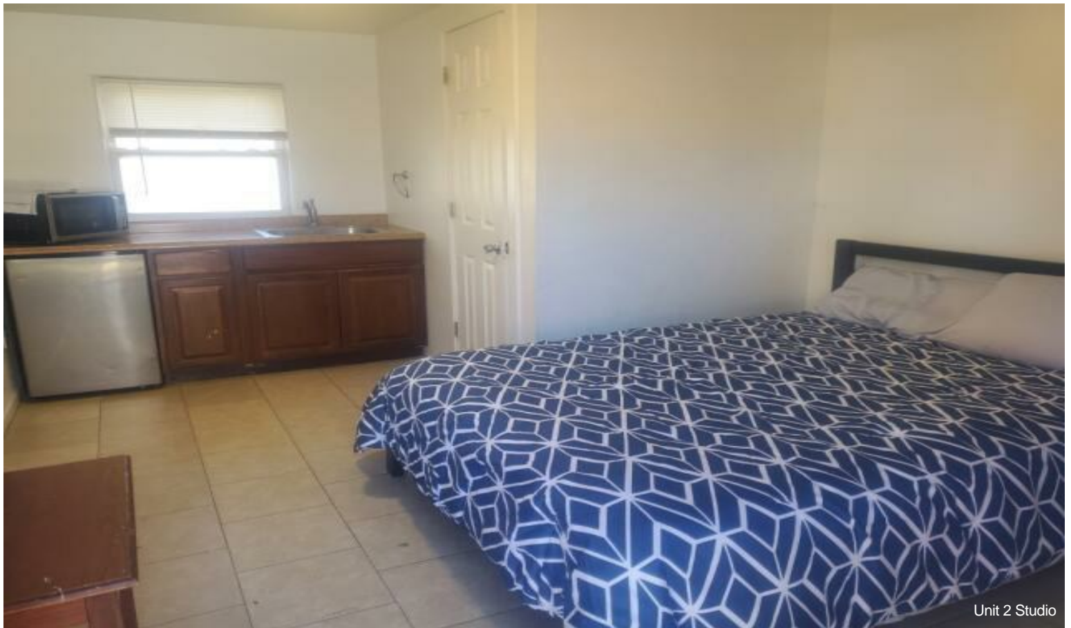
Unit 2 Studio