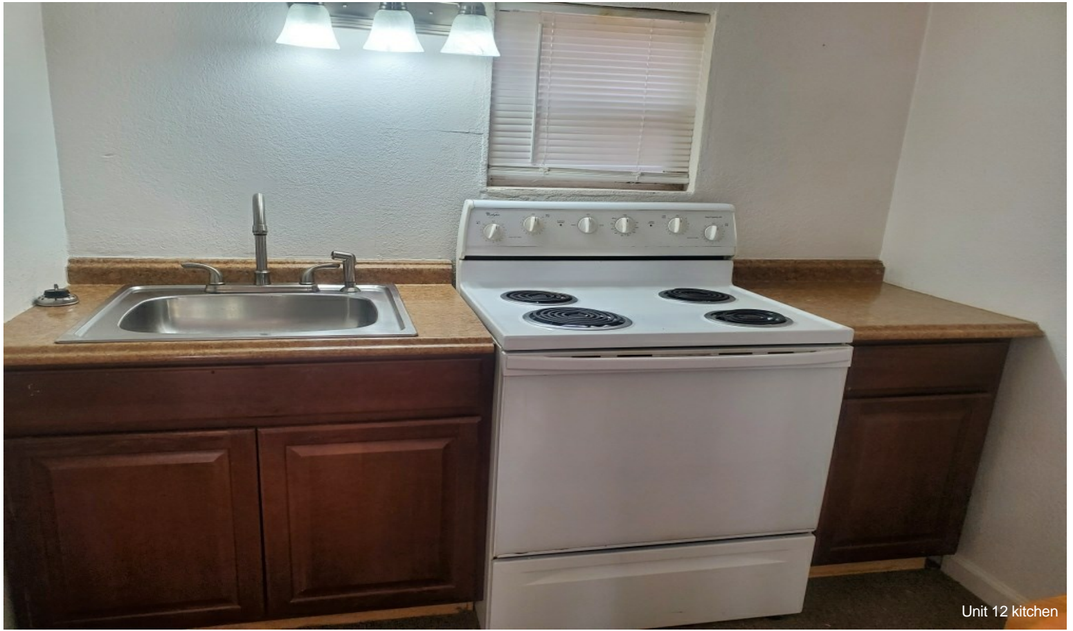
Unit 12 kitchen