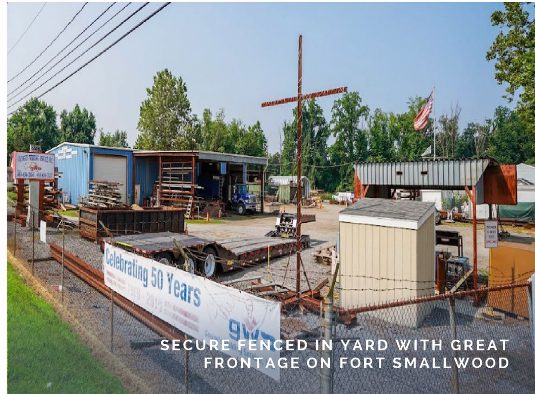
SECURE FENCED IN YARD WITH GREAT FRONTAGE ON FORT SMALLWOOD