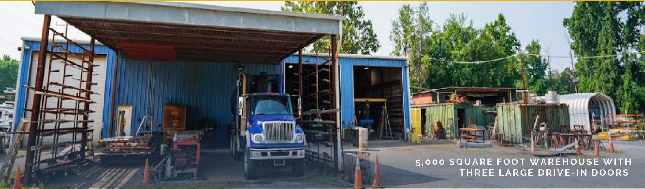
5,000 SQUARE FOOT WAREHOUSE WITH THREE LARGE DRIVE-IN DOORS