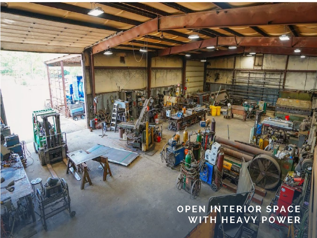
OPEN INTERIOR SPACE WITH HEAVY POWER