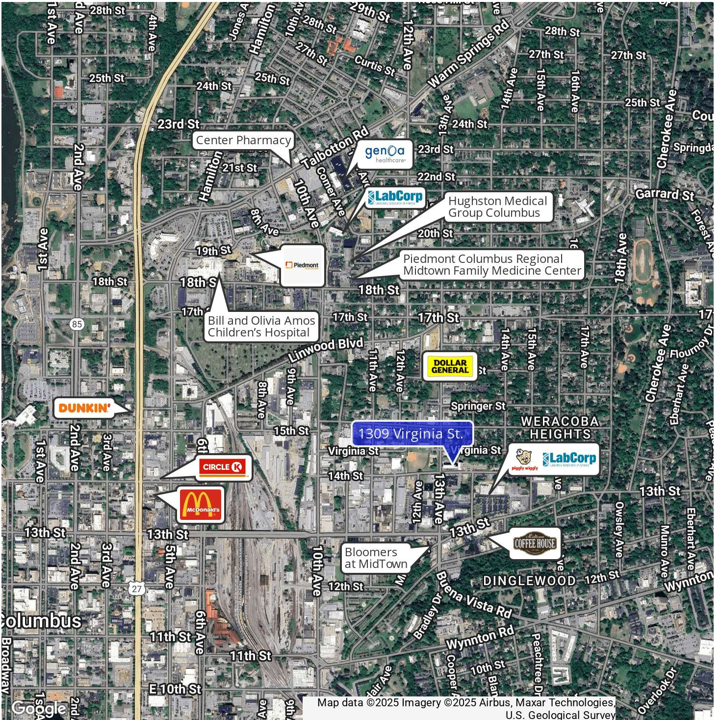
Map data ©2025 Imagery ©2025 Airbus, Maxar Technologies, U.S. Geological Survey

Tripp Crawford (706) 984-1251 tripp@cbckpdd.com