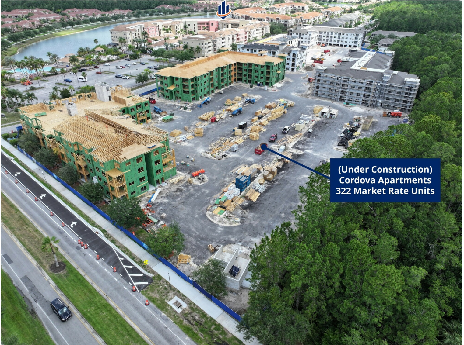
(Under Construction) Cordova Apartments 322 Market Rate Units