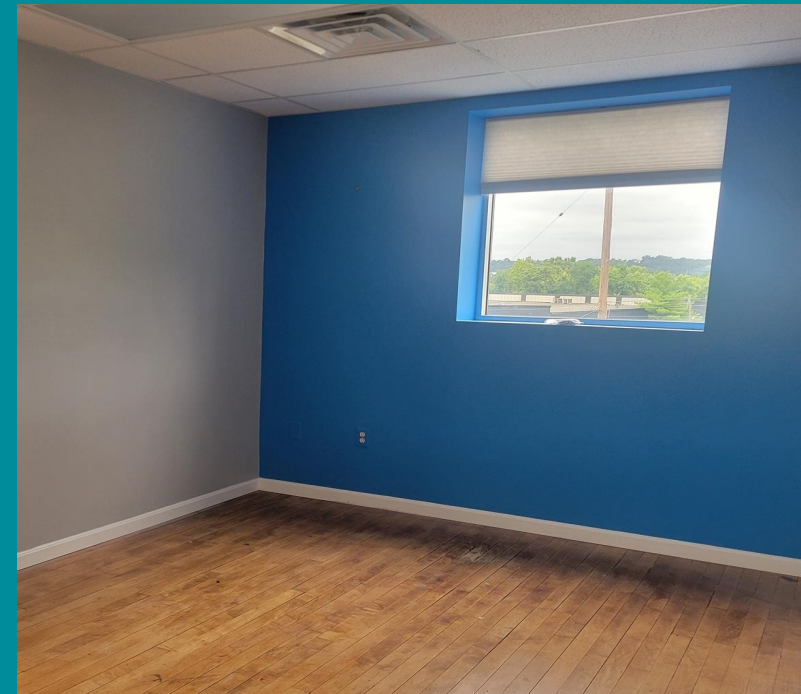
2nd Floor Office