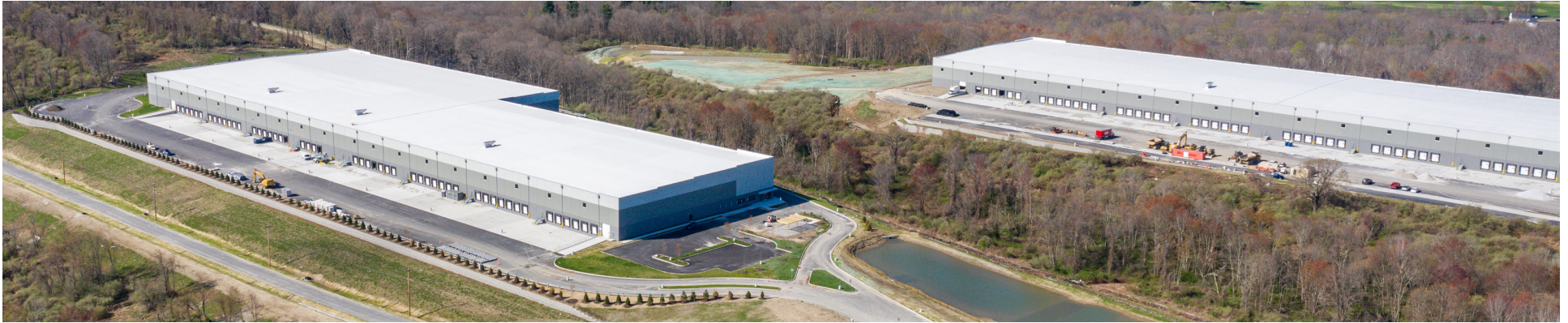
BUILDING B – 618,000 SF