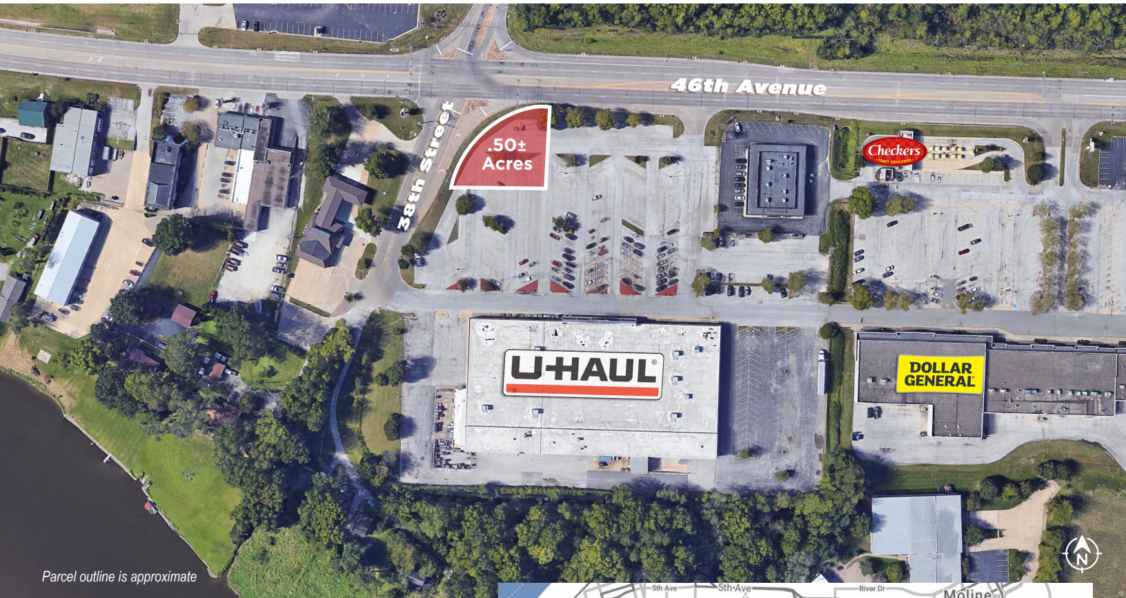
Parcel outline is approximate

Located at the southeast corner of 46th Avenue and 38th Street, at signalized intersection.