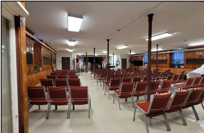
MEETING ROOM FROM BACK