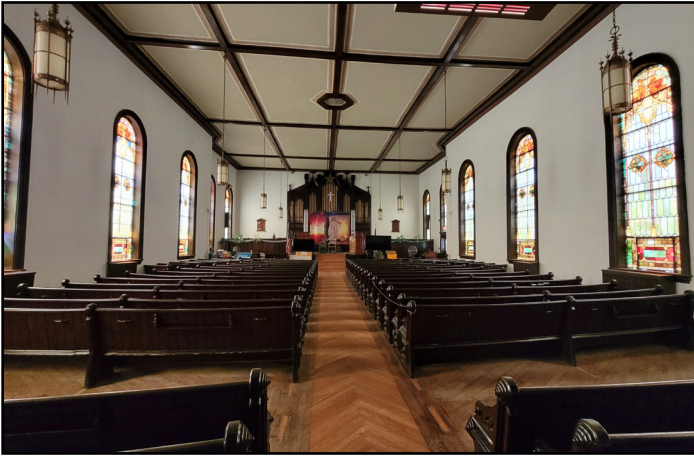
SANCTUARY FROM BACK