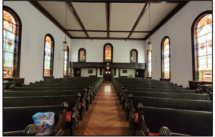
SANCTUARY FROM FRONT