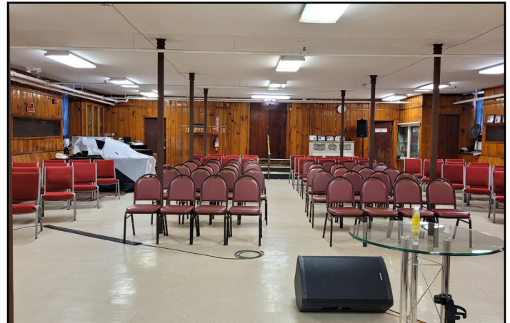
MEETING ROOM FROM FRONT