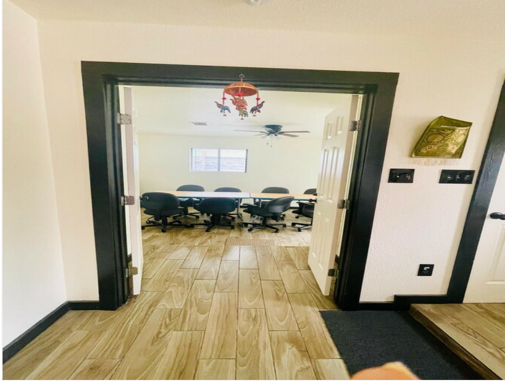
2905 Conference Entry