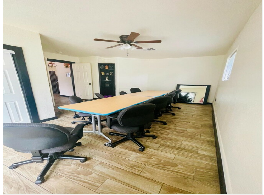
2905 Conference Bldg A