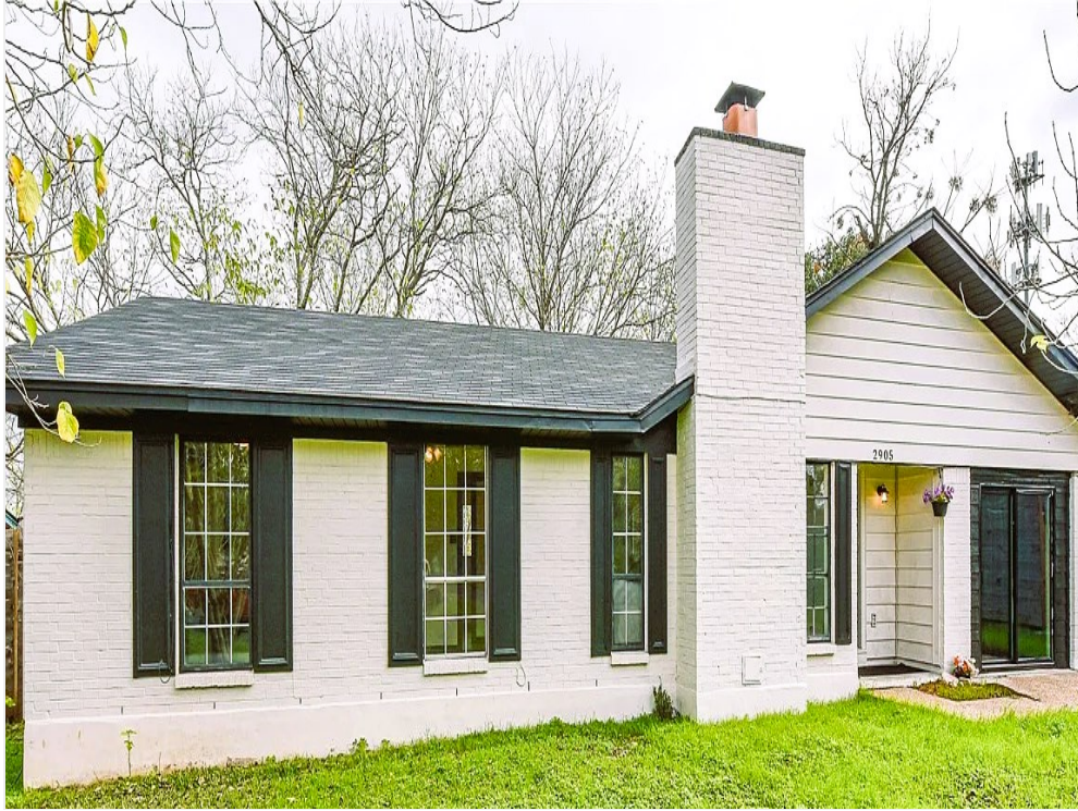
2905 front view