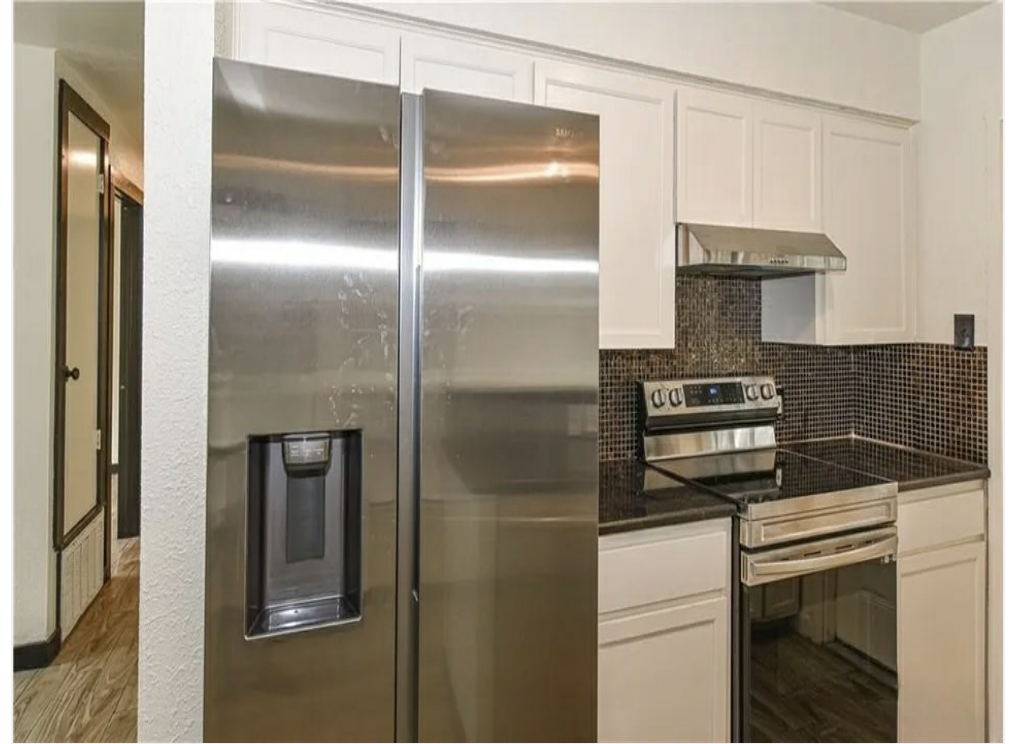
2905 BR appliance