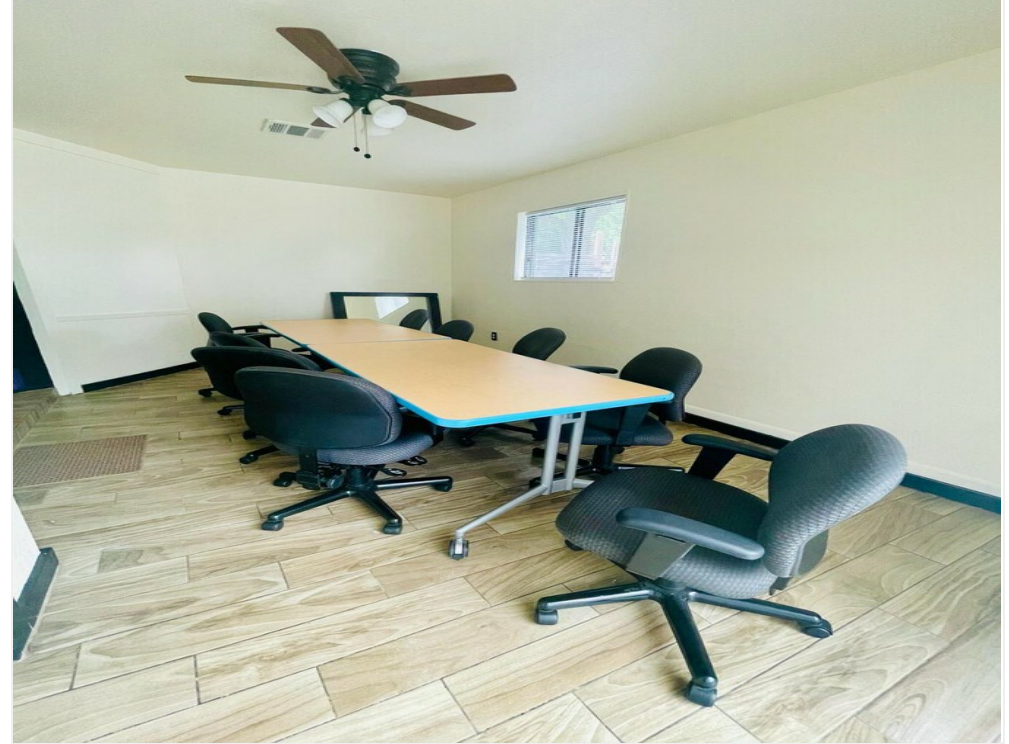
2905 Conference Room