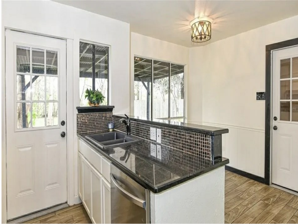
2905 BR Kitchen counter