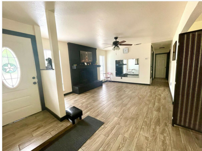
2905 Entry Hall view