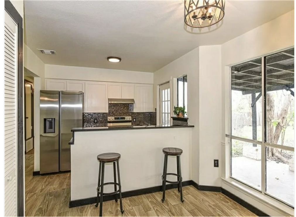
2905 BR Kitchen