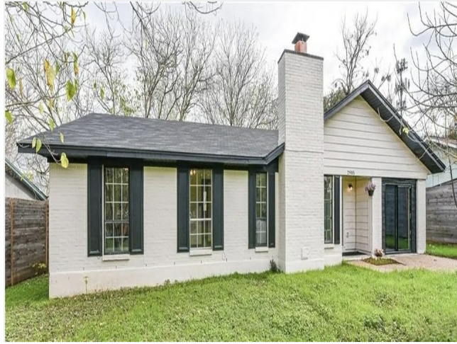
2905 BR front View BLD A

2905 Blue Ridge Dr, Cedar Park, TX 78613